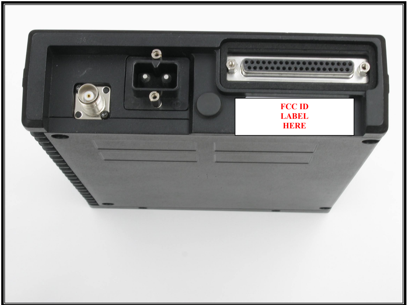
PHOTOGRAPH 2: FCC ID LABEL LOCATION ON REAR OF EUT