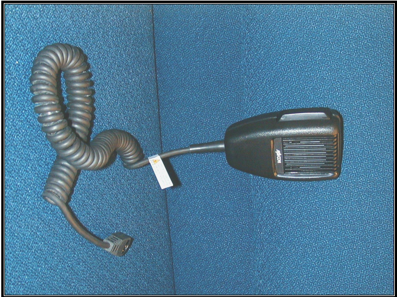
PHOTOGRAPH 7: NOISE CANCELLING MICROPHONE WITH RF LABEL