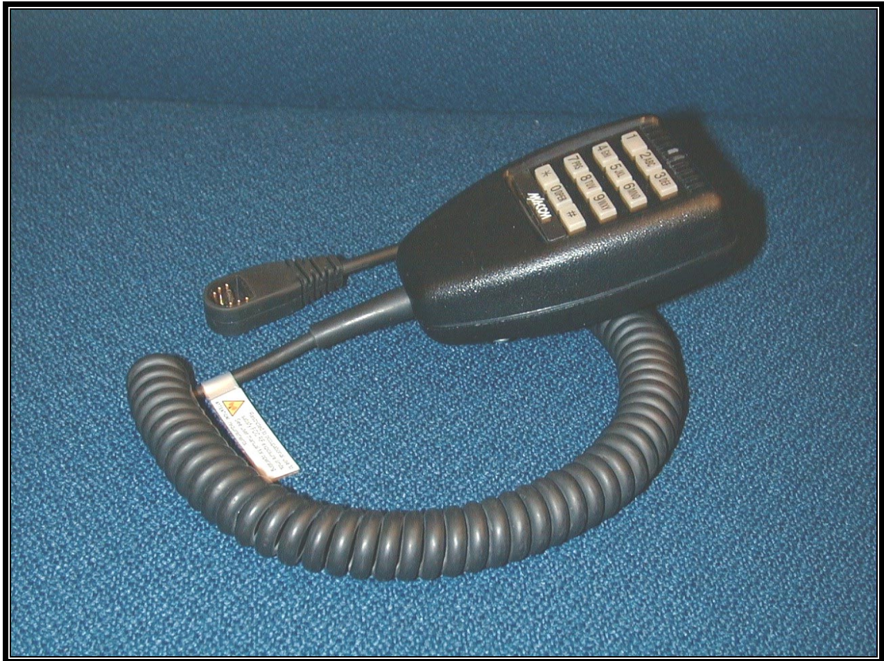
PHOTOGRAPH 5: DTMF MICROPHONE WITH RF LABEL