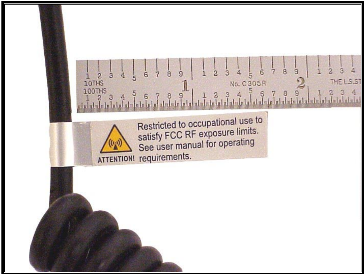
PHOTOGRAPH 3: RF LABEL SAMPLE