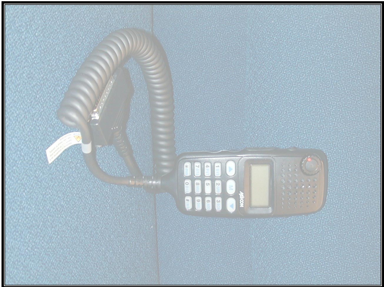
PHOTOGRAPH 6: HAND HELD CONTROLLER WITH RF LABEL