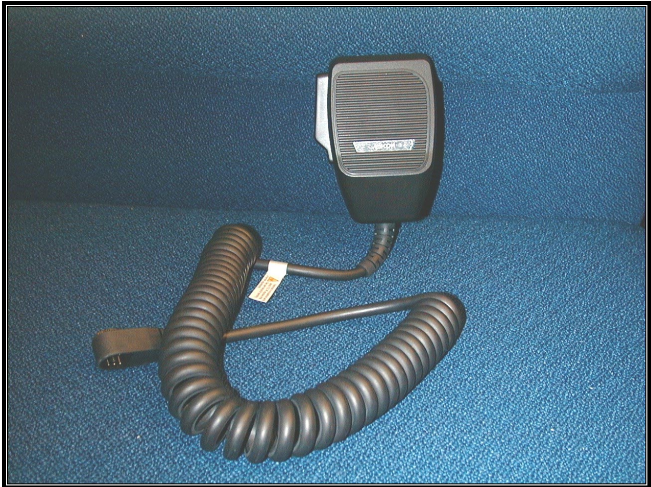
PHOTOGRAPH 4: STANDARD MICROPHONE WITH RF LABEL