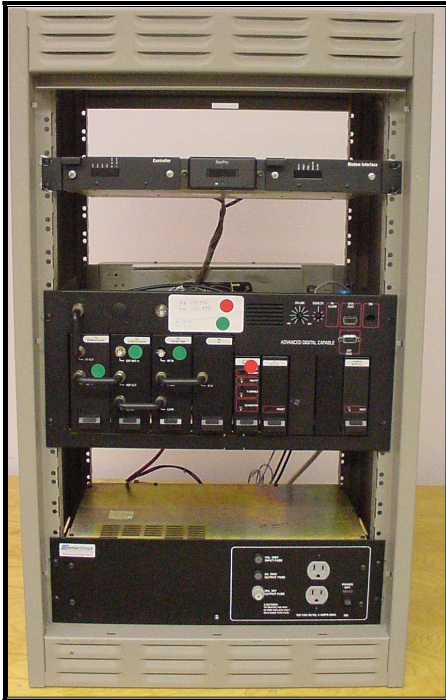
PHOTOGRAPH 3: MASTRIII FRONT VIEW