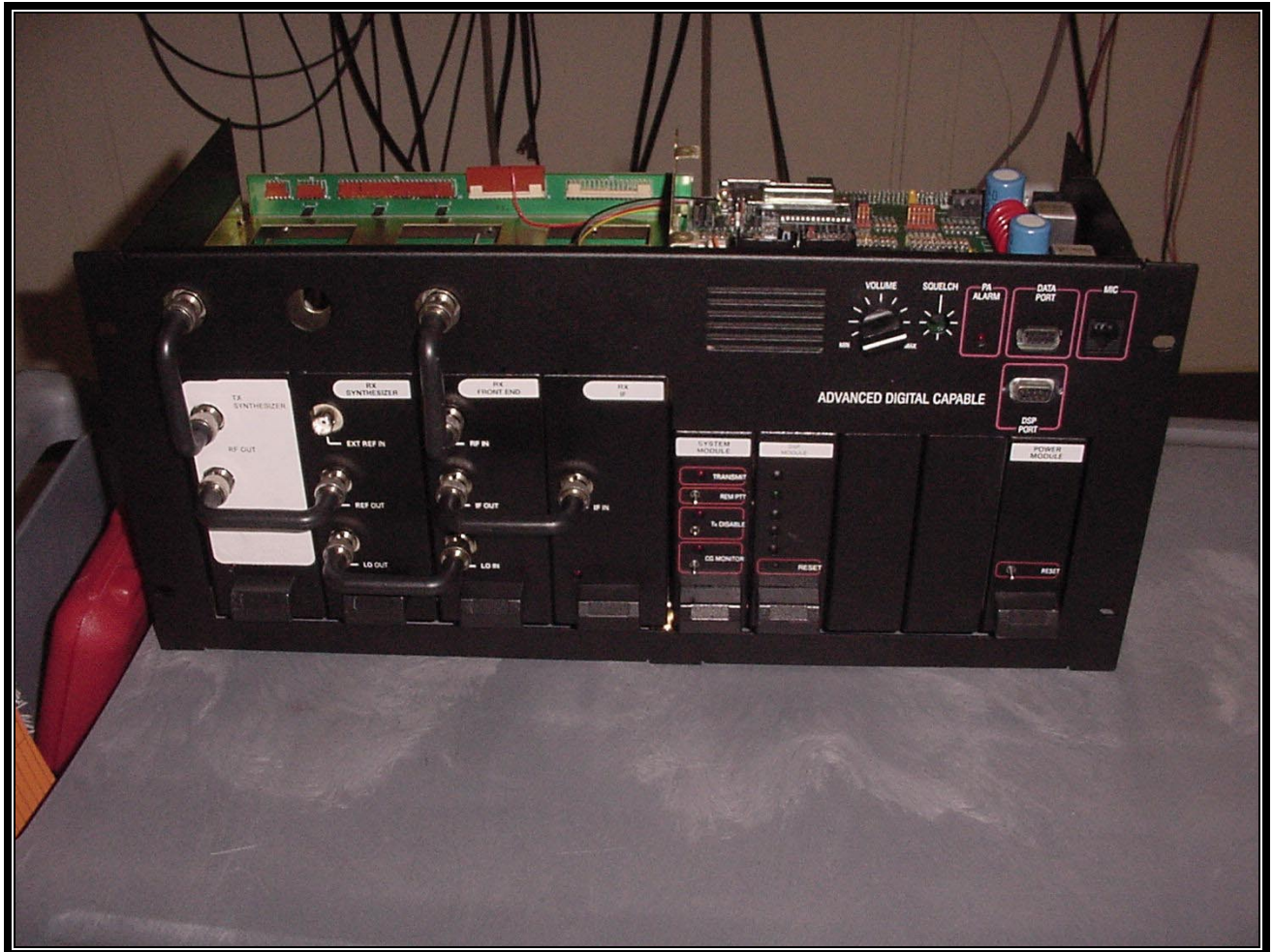
PHOTOGRAPH 3: MASTR III FRONT