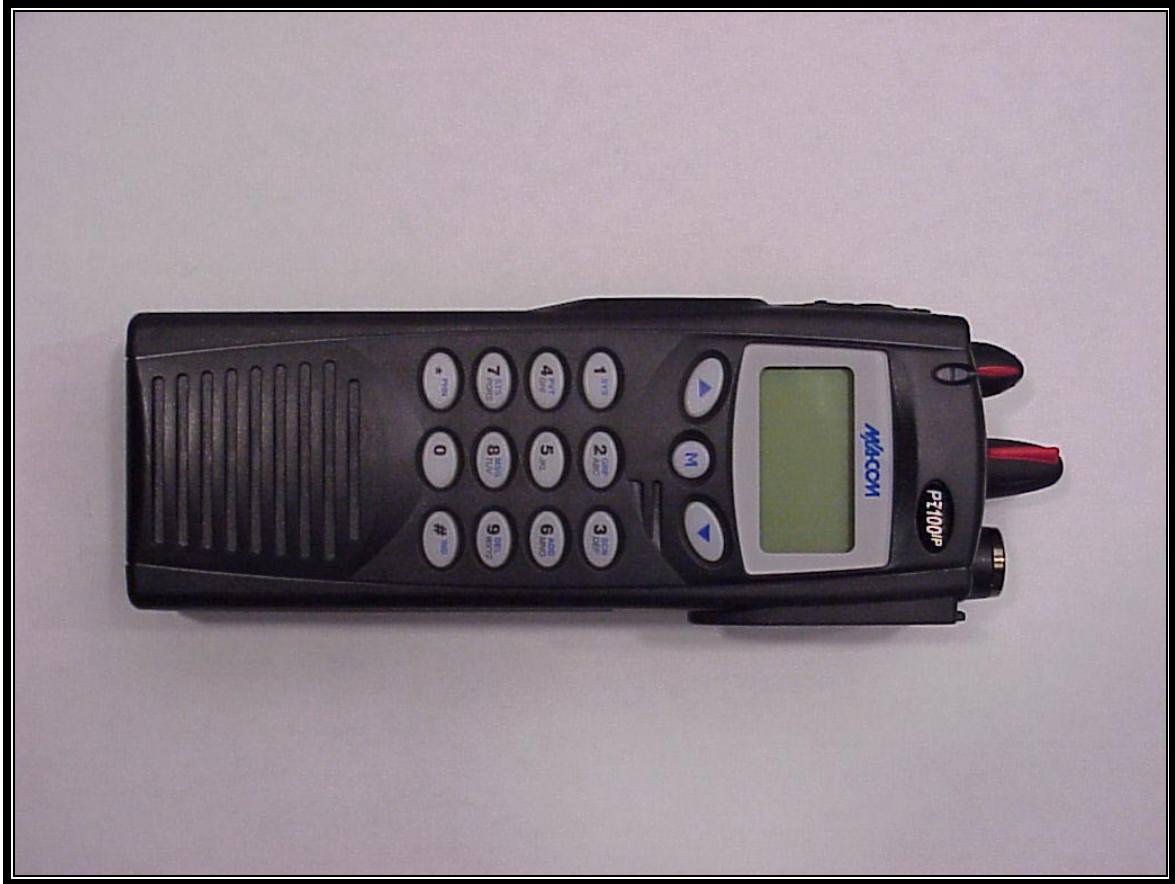
PHOTOGRAPH 4: UHF-L P7100 IP FRONT VIEW