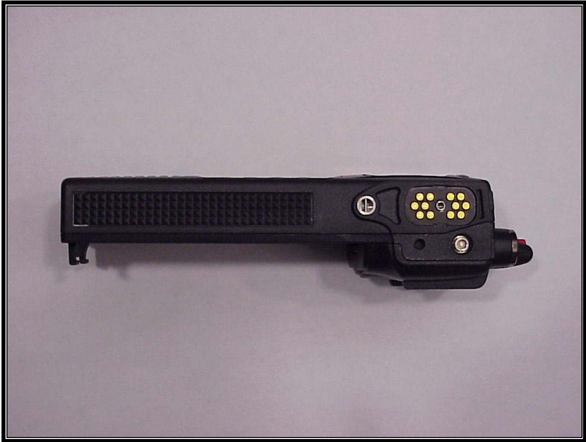
PHOTOGRAPH 5: UHF-L P7100 IP SIDE VIEW