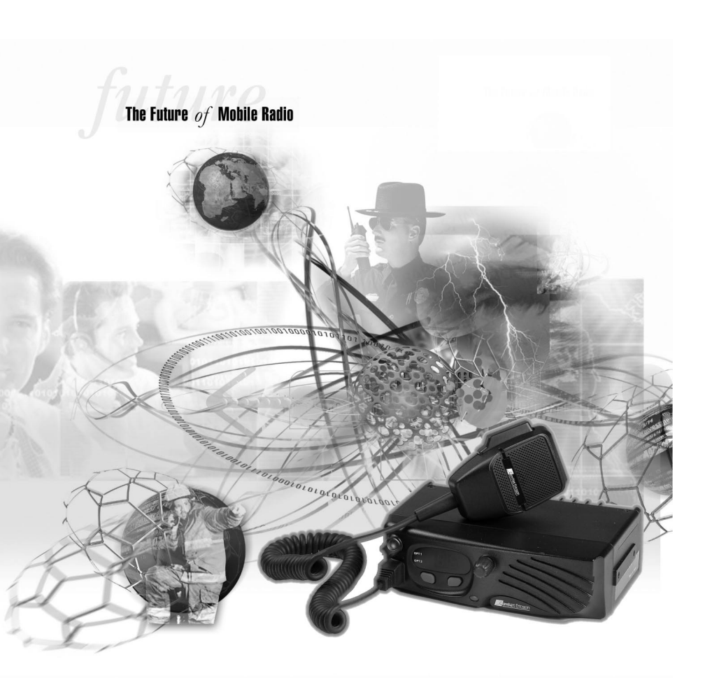
PANTHER™ 300M VHF Mobile Radio