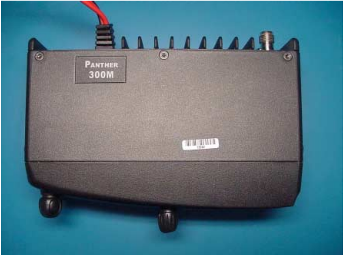
PHOTOGRAPH 14: TOP VIEW

COMPANY: Com-Net Ericsson Critical Radio Systems, Inc. FCC ID: OWDTR-0004-A MODEL: TR-0004-A {Panther 300M VHF (150-174 MHz)} WORK ORDER: 2001057 / QRTL01-031 / {REV-3}