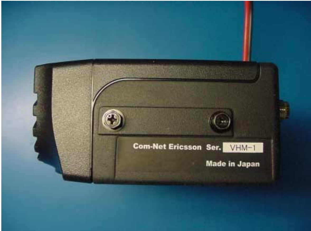
PHOTOGRAPH 18: RIGHT SIDE VIEW

COMPANY: Com-Net Ericsson Critical Radio Systems, Inc. FCC ID: OWDTR-0004-A MODEL: TR-0004-A {Panther 300M VHF (150-174 MHz)} WORK ORDER: 2001057 / QRTL01-031 / {REV-3}