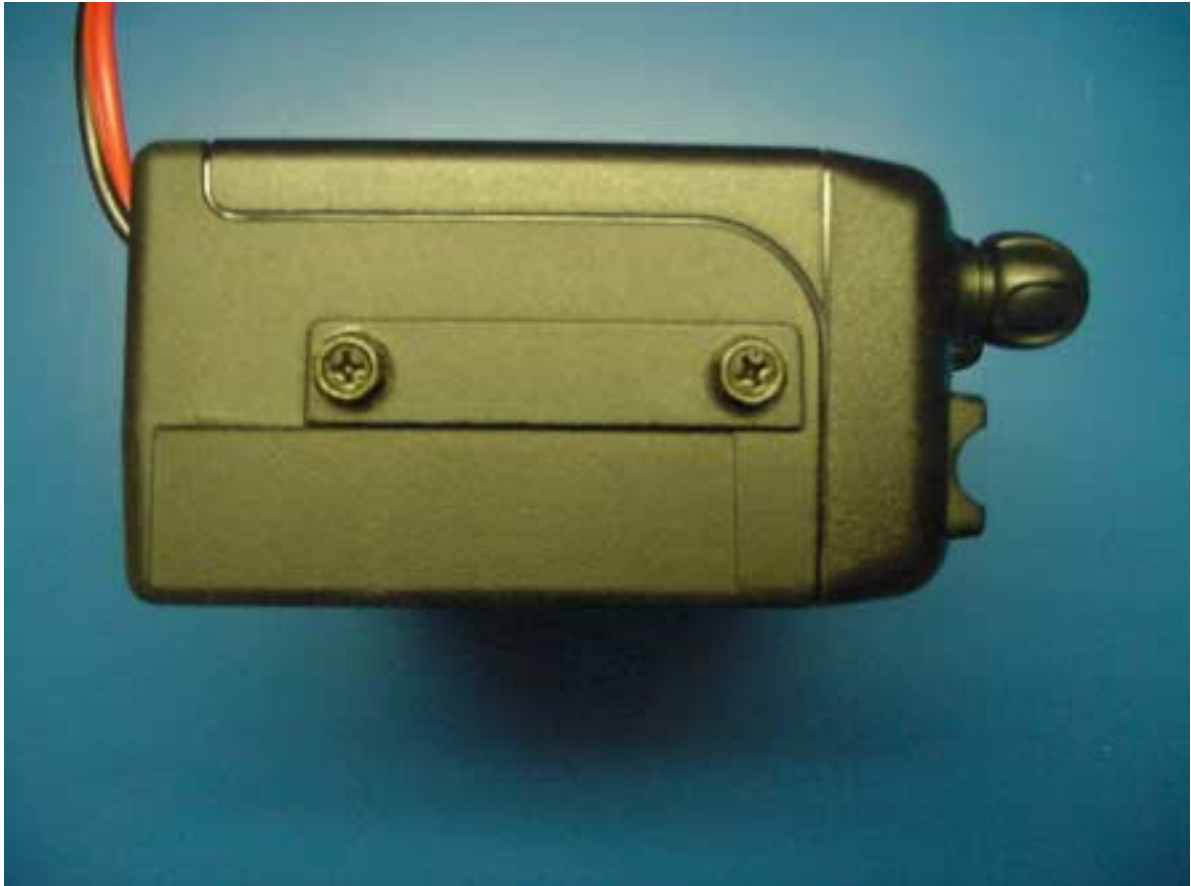
PHOTOGRAPH 17: LEFT SIDE VIEW

COMPANY: Com-Net Ericsson Critical Radio Systems, Inc. FCC ID: OWDTR-0004-A MODEL: TR-0004-A {Panther 300M VHF (150-174 MHz)} WORK ORDER: 2001057 / QRTL01-031 / {REV-3}