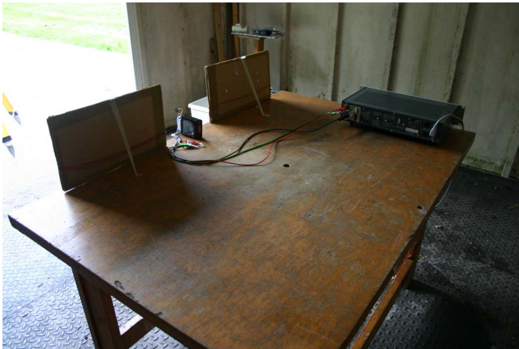
setup for PD234