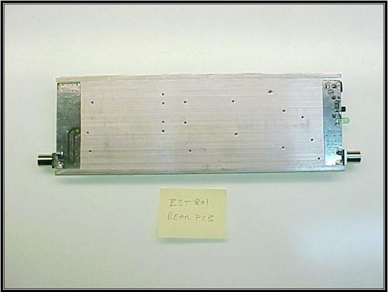
PHOTOGRAPH 13: PCB REAR VIEW