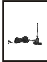
Dual Band Glass Mag Antenna