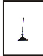
Dual Band Glass Mount 4" Antenna