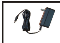
AC/DC Power Supply (Optional) Allows Use of Booster In Home Or Office