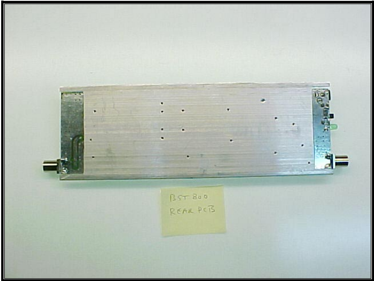
PHOTOGRAPH 14: PCB REAR VIEW