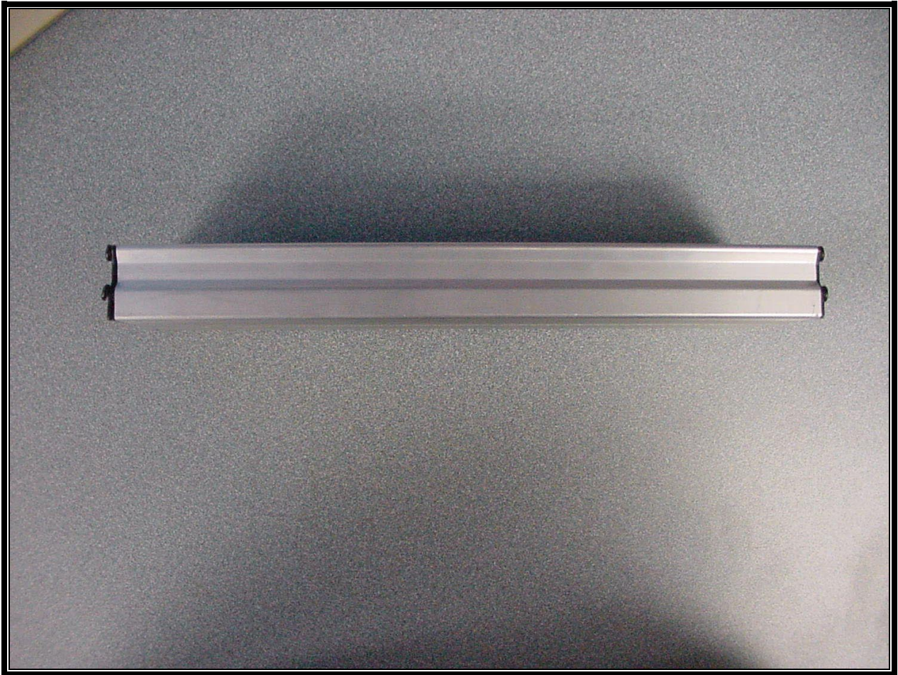
PHOTOGRAPH 7: EUT SIDE VIEW