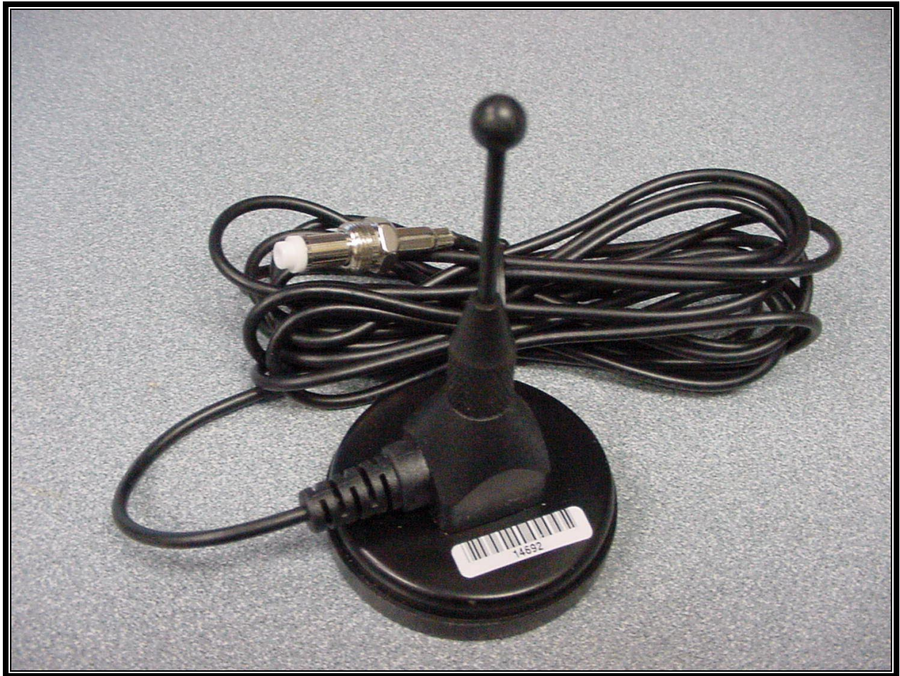
PHOTOGRAPH 10: MAGNETIC MOUNT ANTENNA WITH CONNECTOR