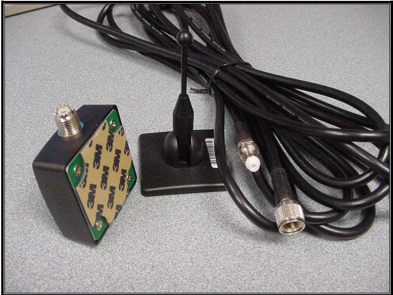
PHOTOGRAPH 11: 0DB GLASS MOUNT ANTENNA WITH CABLES AND CONNECTORS