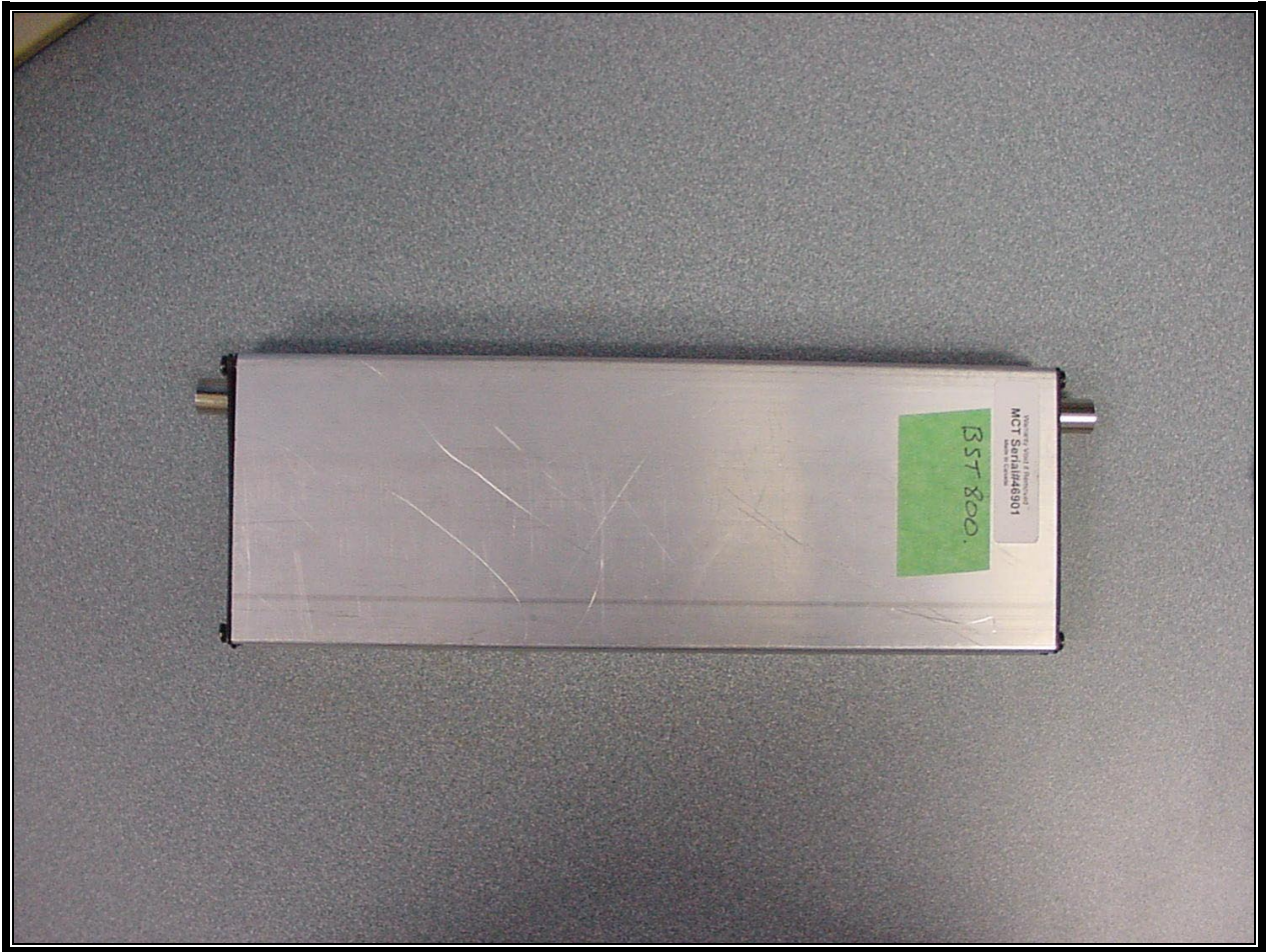
PHOTOGRAPH 5: EUT BOTTOM VIEW