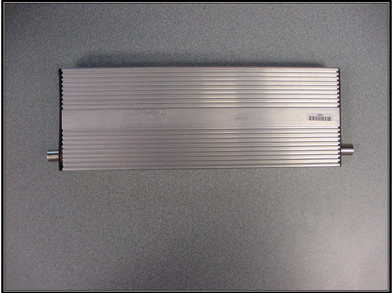
PHOTOGRAPH 4: EUT TOP VIEW