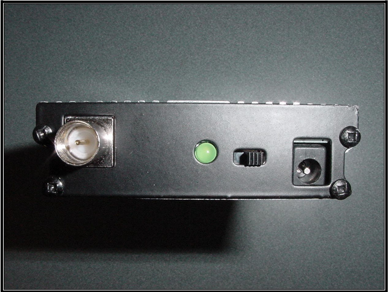
PHOTOGRAPH 6: EUT OUTPUT SIDE