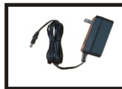
AC/DC Power Supply (Optional) Allows Use of Booster in Home or Office