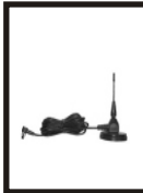
Dual Band Glass Mag Antenna