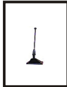
Dual Band Glass Mount 4" Antenna