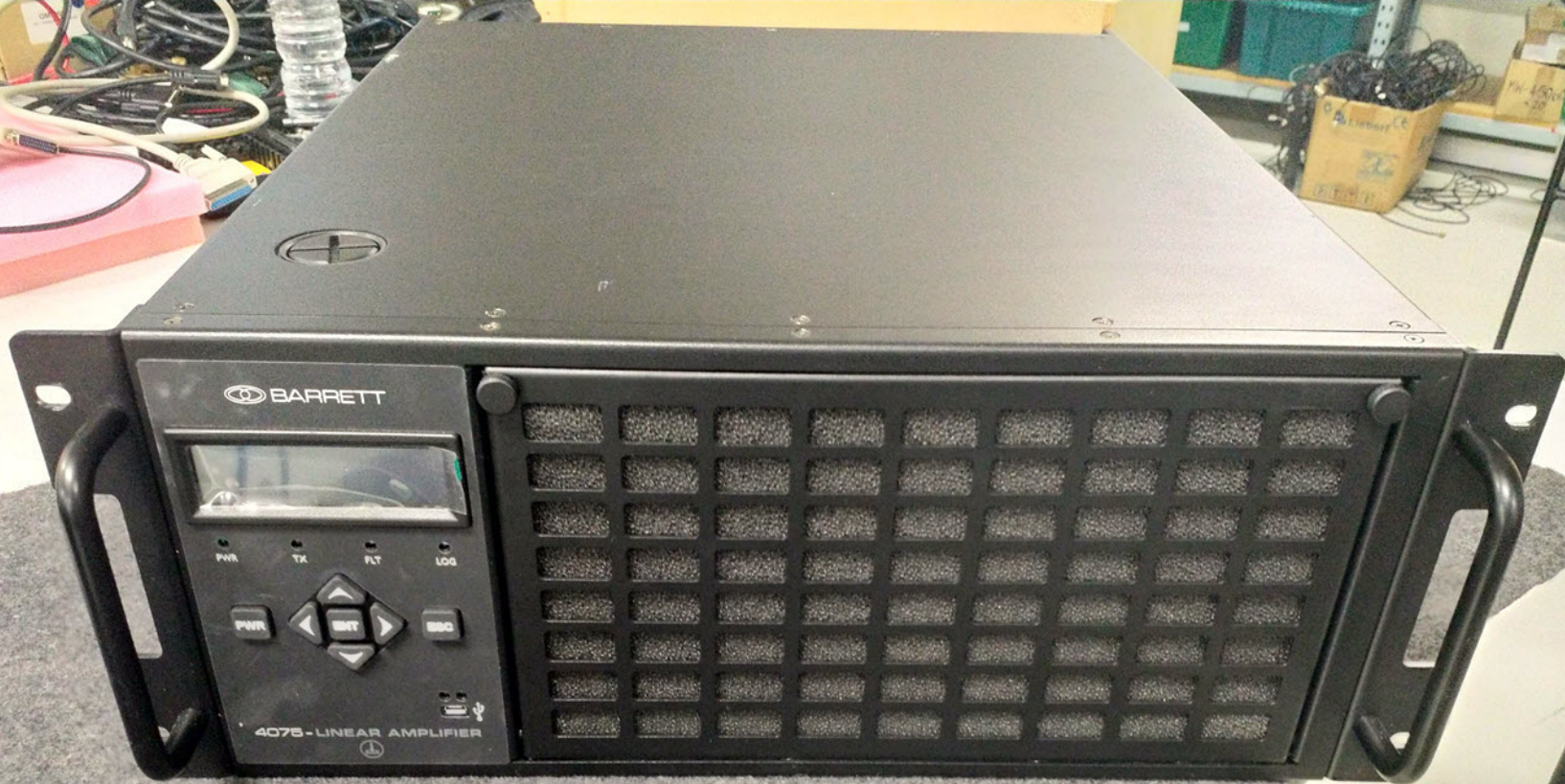
1000 watt amplifier - Front