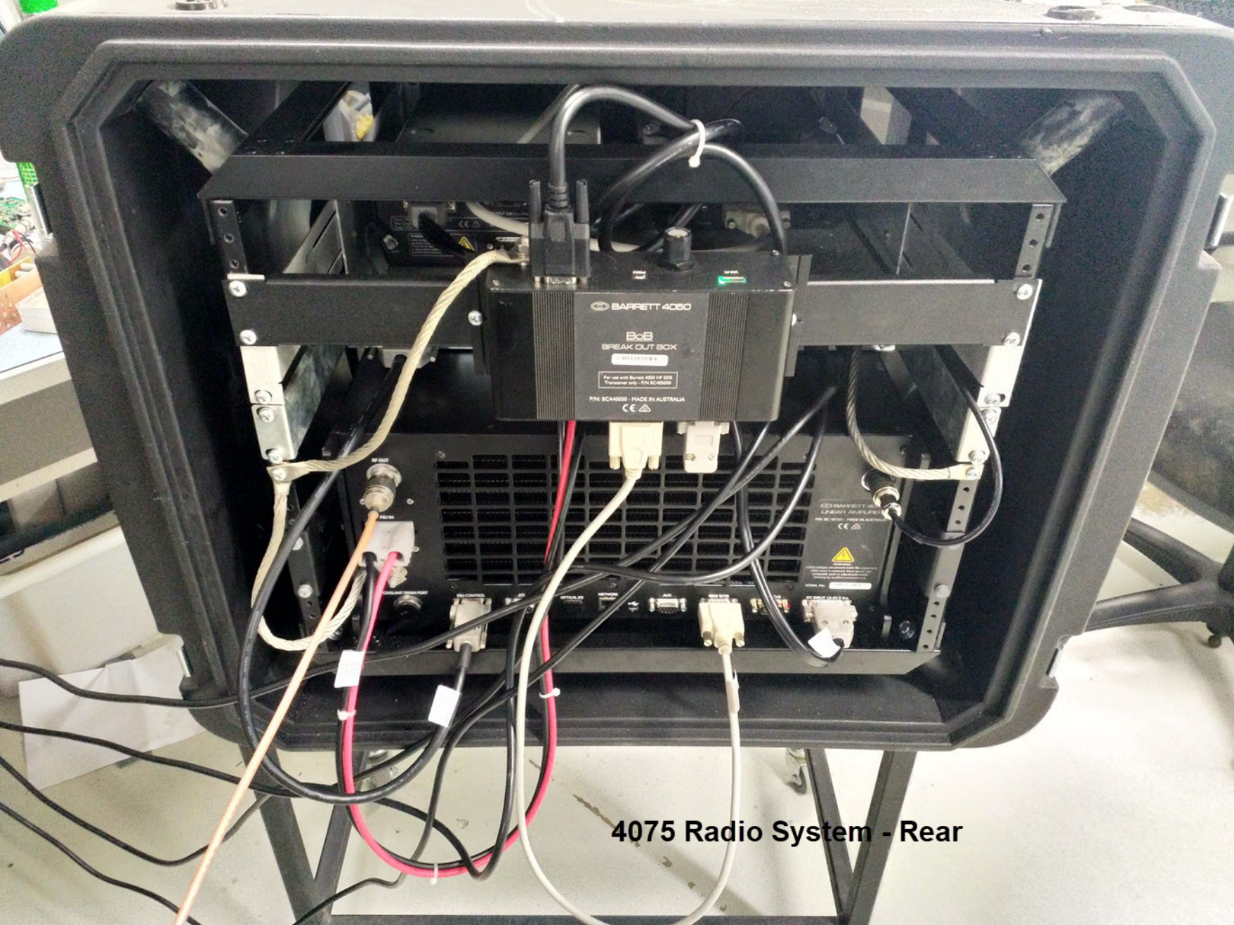
4075 Radio System - Rear