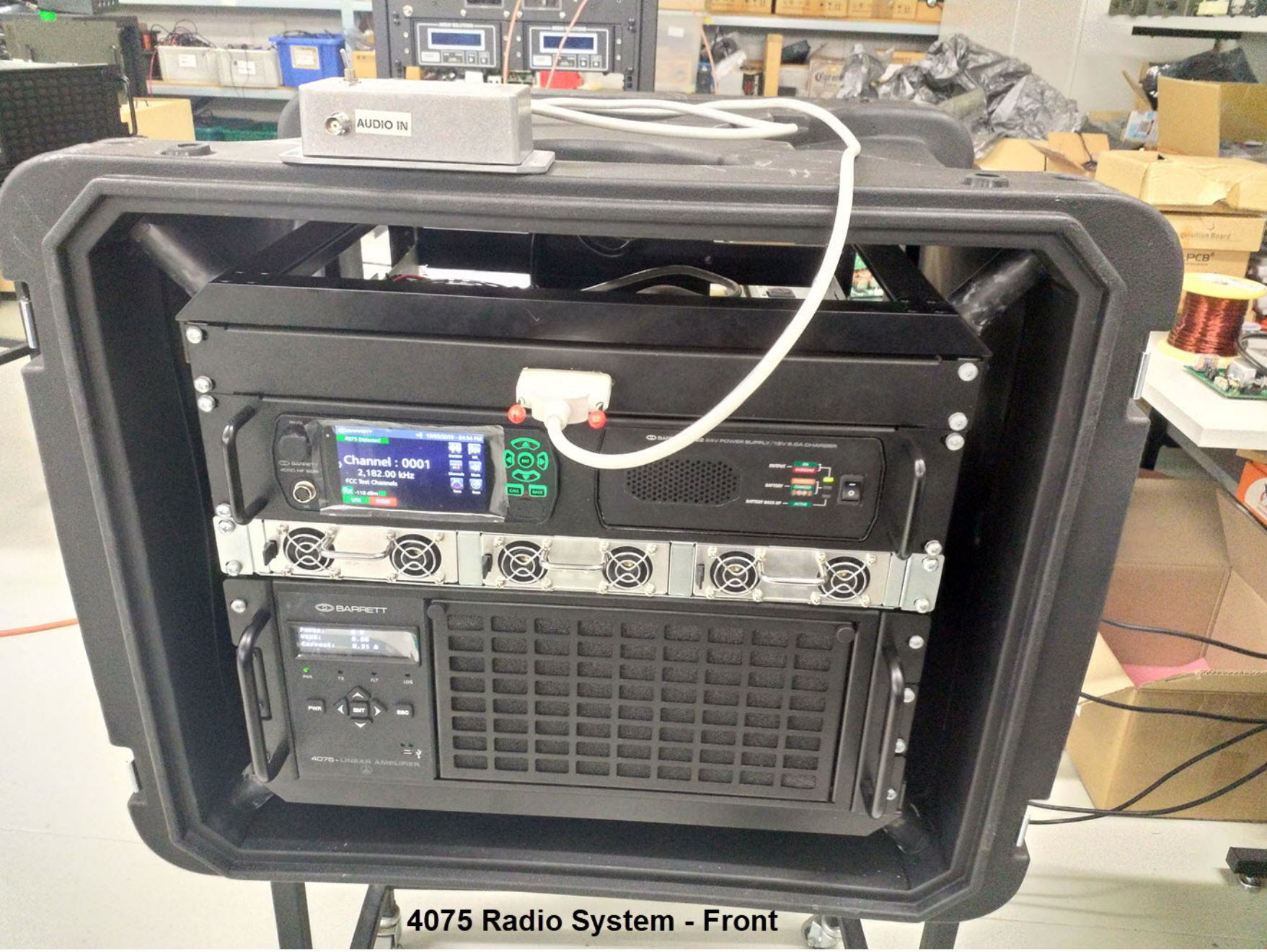
4075 Radio System - Front