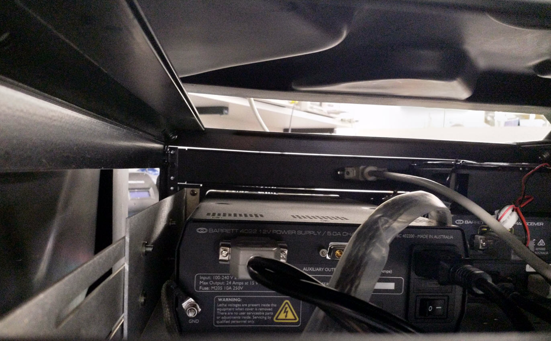
4075 Radio System Rear