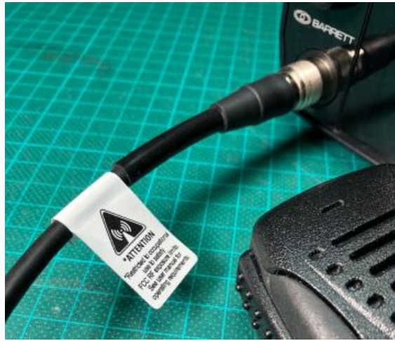
Figure 4 – RF Exposure Warning Label Position