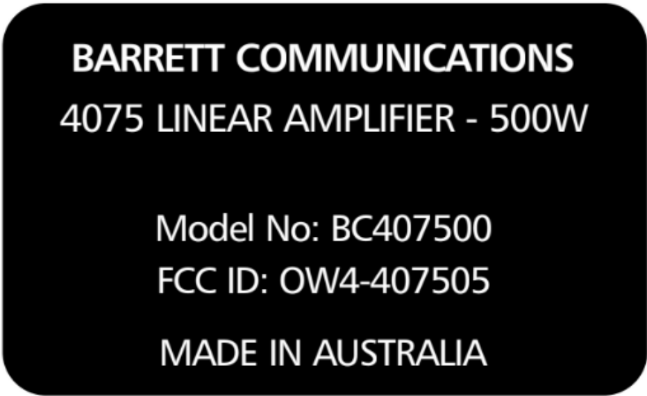
Figure 2 - FCC Label for BC407500 500 W model