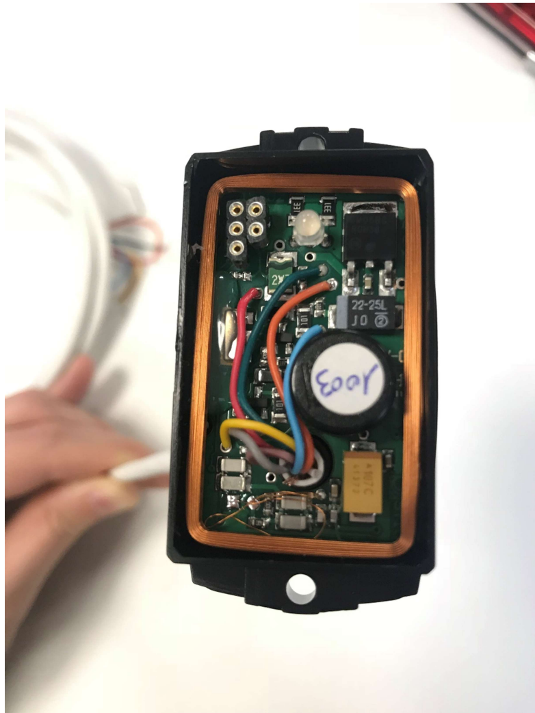
Motherboard integrated in the plastics before resin coating