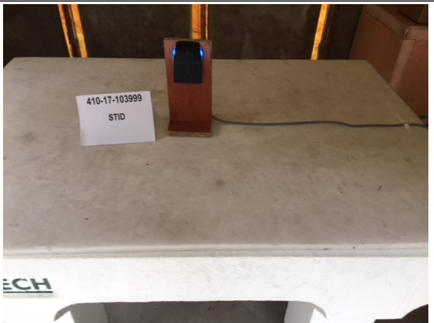
Measurement on open area test site (f<30MHz)