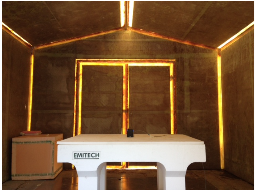
Radiated measurement on open area test site