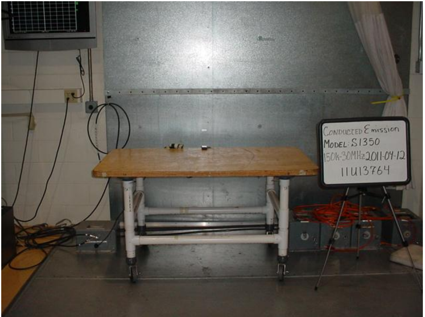
Figure 1 Test Setup for Conducted Emissions