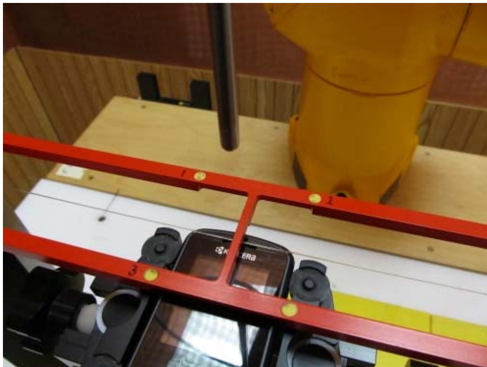
Figure 1b – HAC T-Coil Test Setup