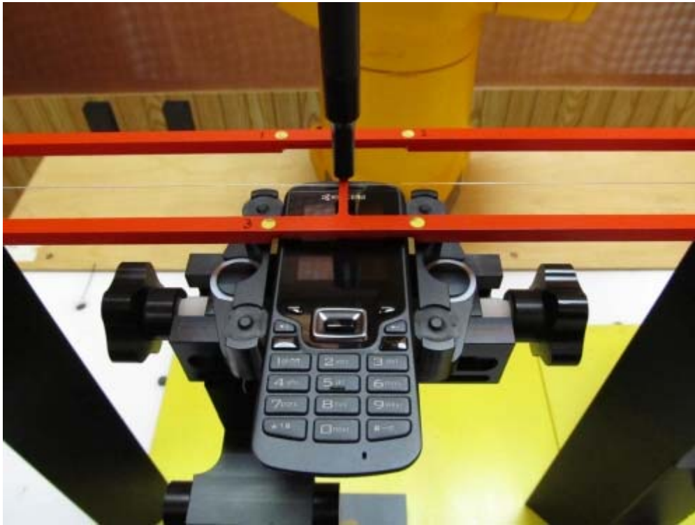
Figure 1a – HAC RF Emission Test Setup