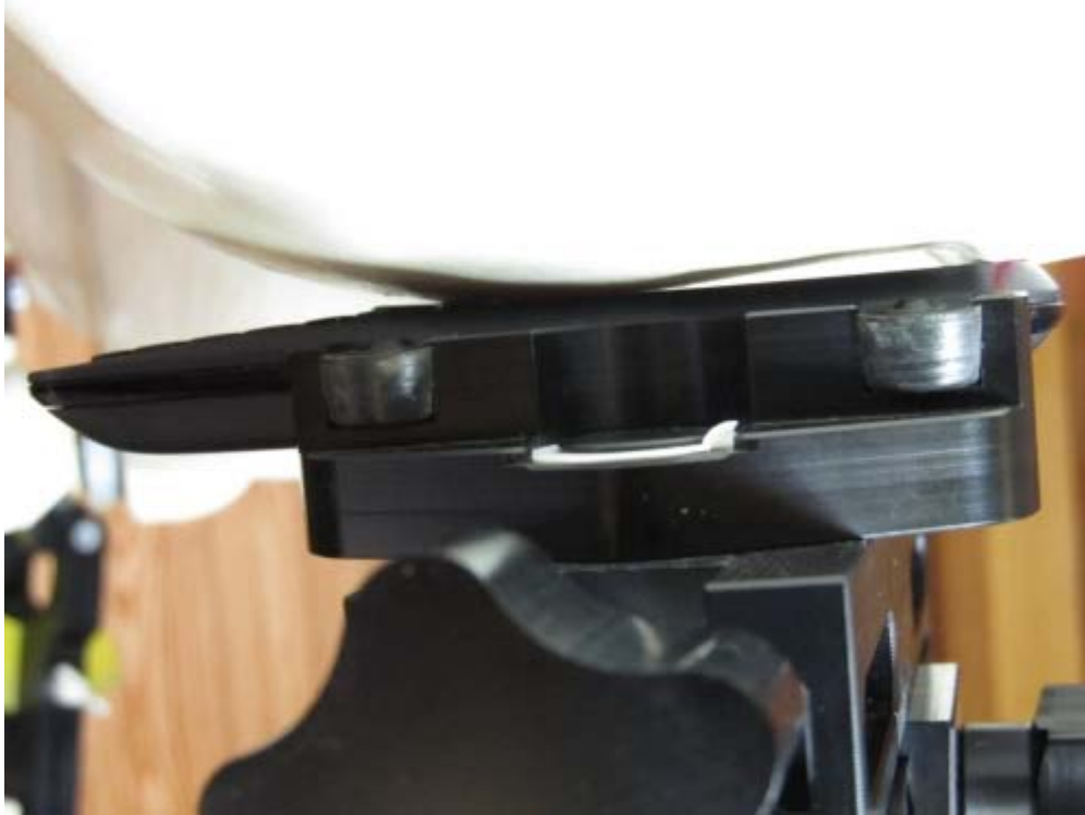
Figure 9E.1 Phone against the head (Left cheek position)