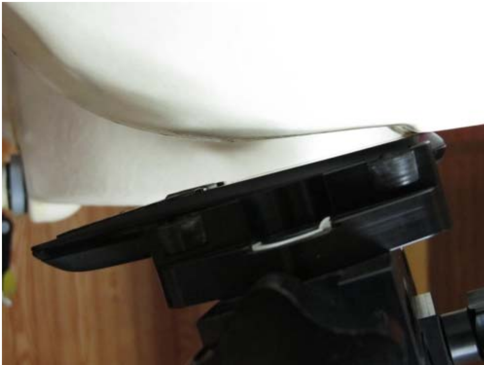
Figure 9E.2 Phone against the head (Left Tilt position)