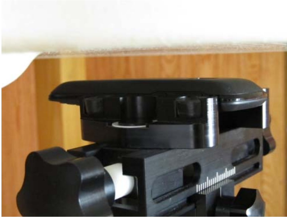
Figure 9E.3 Body SAR setup (Face Down, 15mm Air Separation)