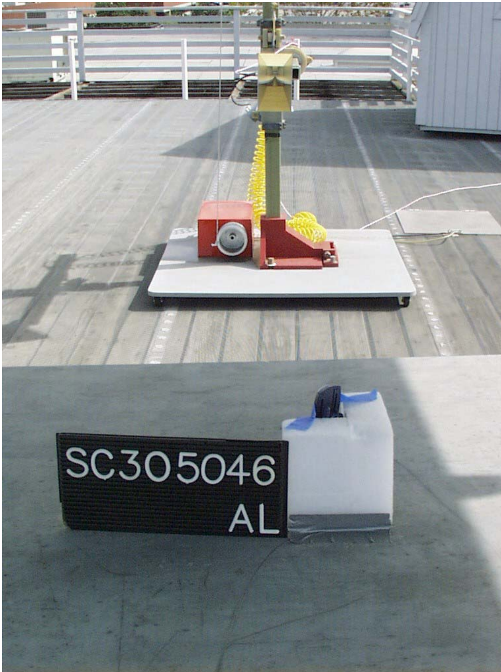
Photograph of Test Setup