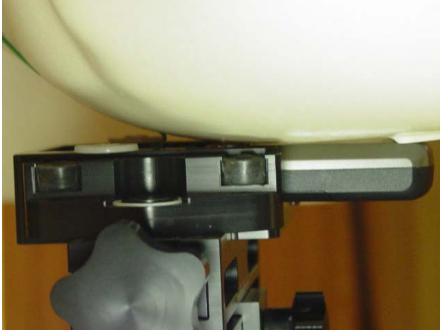
Figure 9E.1 Phone against the head (Left cheek position)