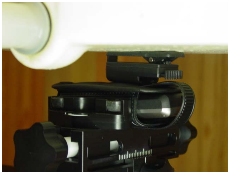
Figure 9E.4 Body SAR setup with universal pouch (CV90-61346)