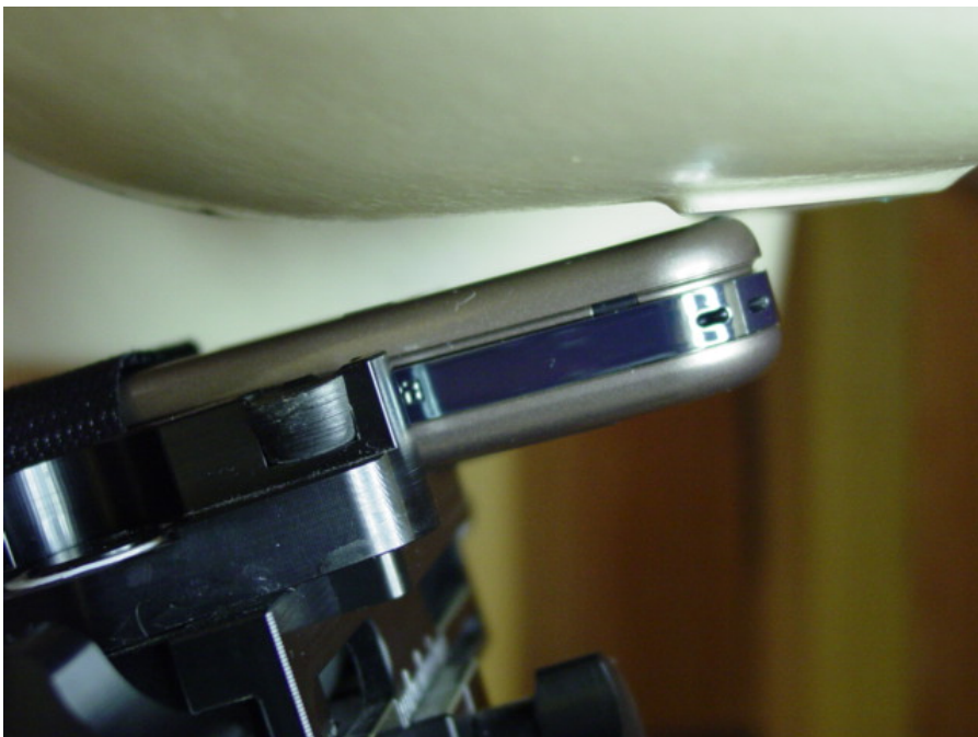
Figure 9E.2 Phone against the head (Left Tilt position)