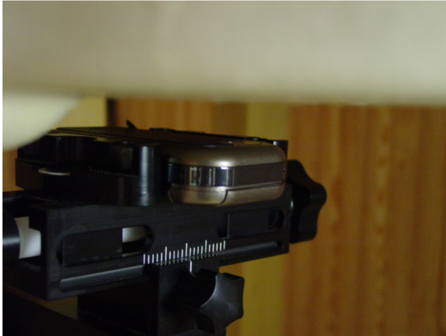
Figure 9E.3 Body SAR Phone setup (15mm Air Separation)