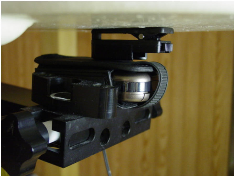
Figure 9E.4 Body SAR Phone setup (CV90-61344-03)