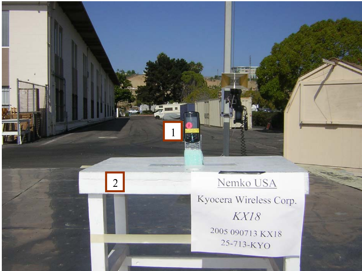
Figure 1. General EUT Test Setup Picture