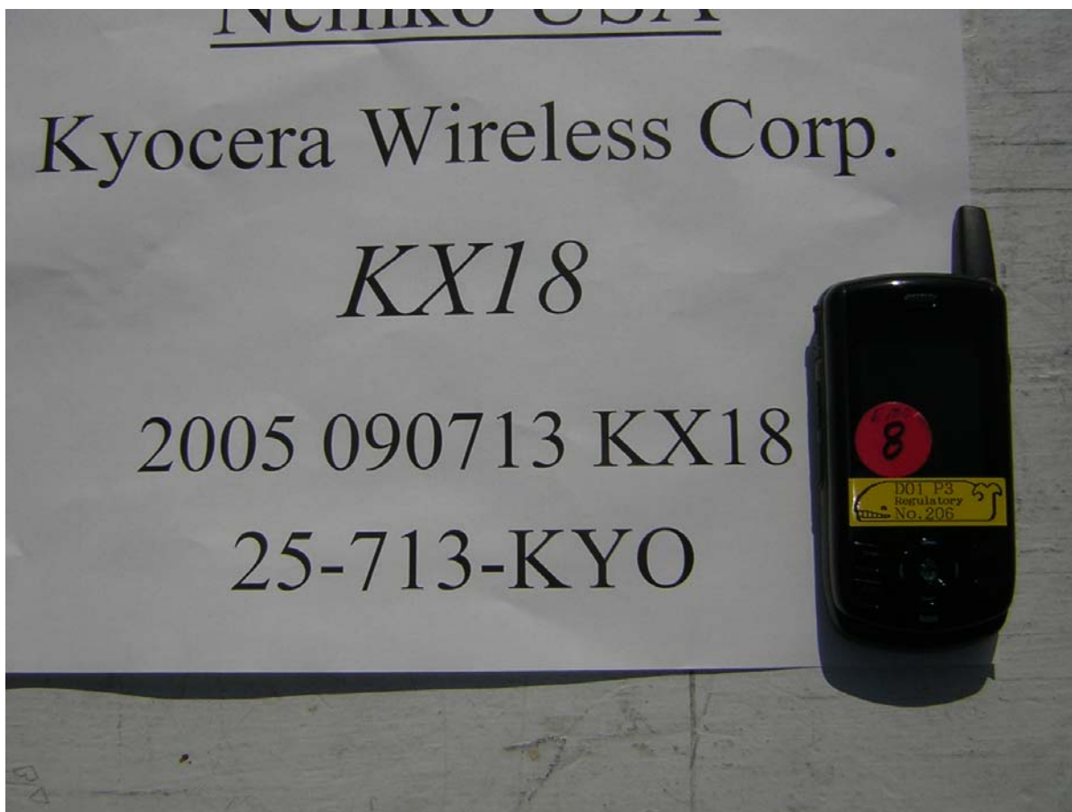
Photograph 2. KX18, Tri Mode Mobile Cellular Phone (Closed)