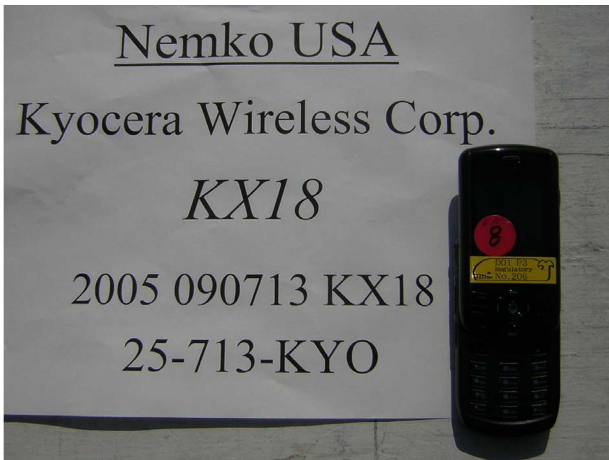
Photograph 1. KX18, Tri Mode Mobile Cellular Phone (Open)