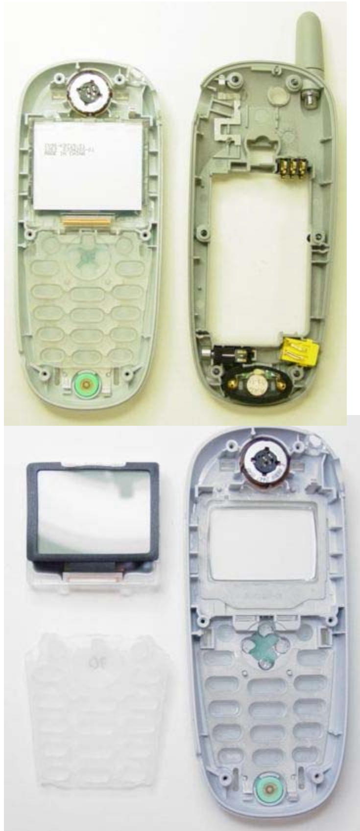
Exhibit 8: Internal Photos