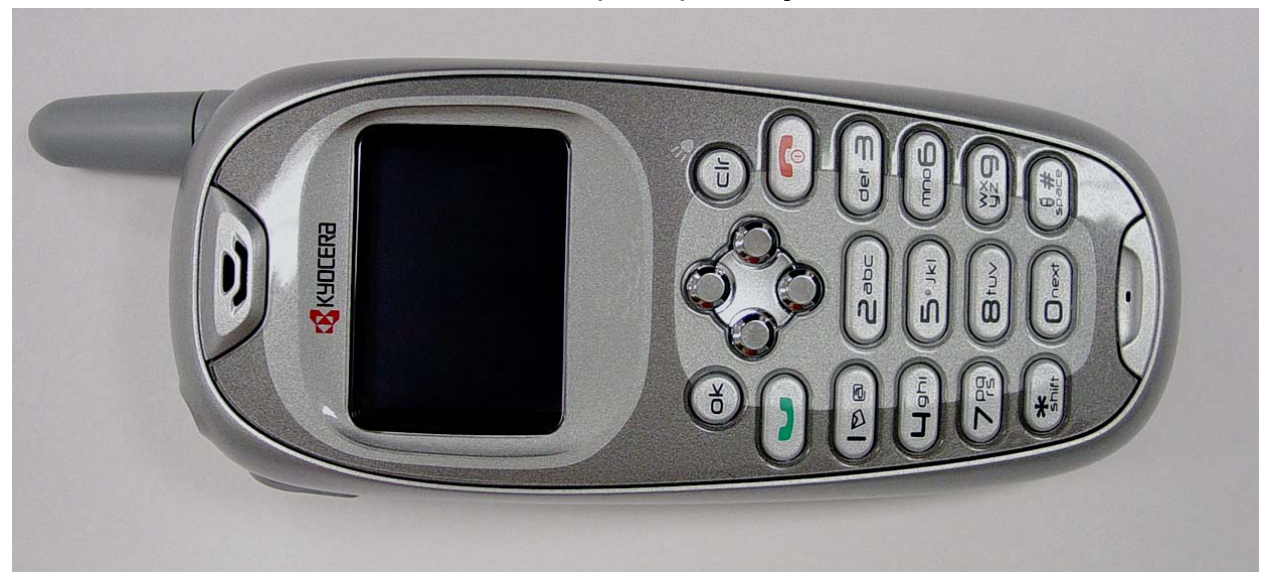
K404A and K430 (Rave) Family Back