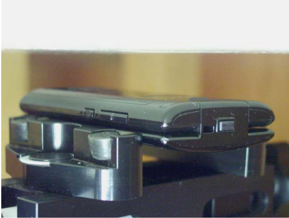
Figure 9E.3 Body SAR setup (15mm Air Separation Phone Closed)