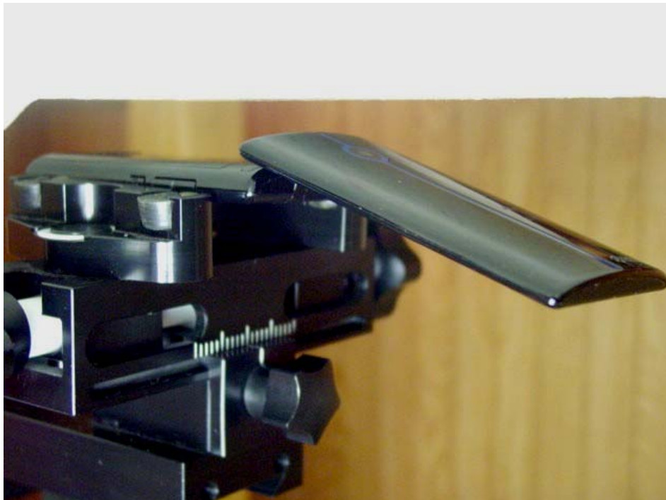
Figure 9E.4 Body SAR setup (15mm Air Separation Phone Open)