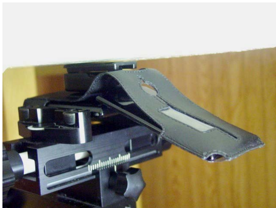
Figure 9E.6 Body SAR setup (CV90-B3916-02 Phone Open)