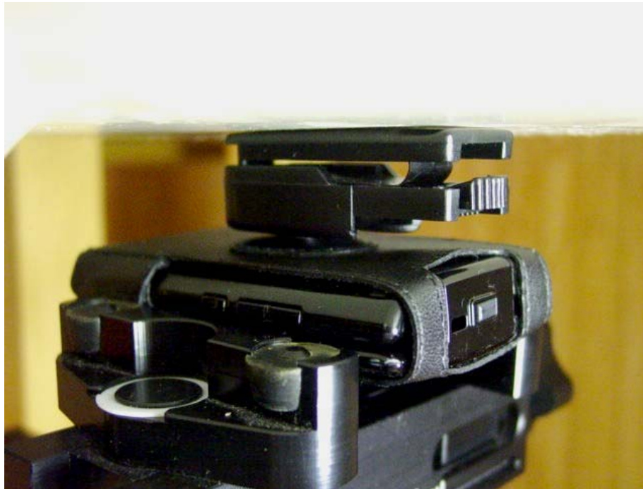
Figure 9E.5 Body SAR setup (CV90-B3916-02 Phone Closed)