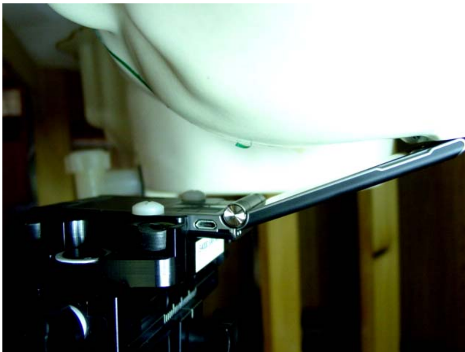
Figure 9E.2 Phone against the head (Left Tilt position)