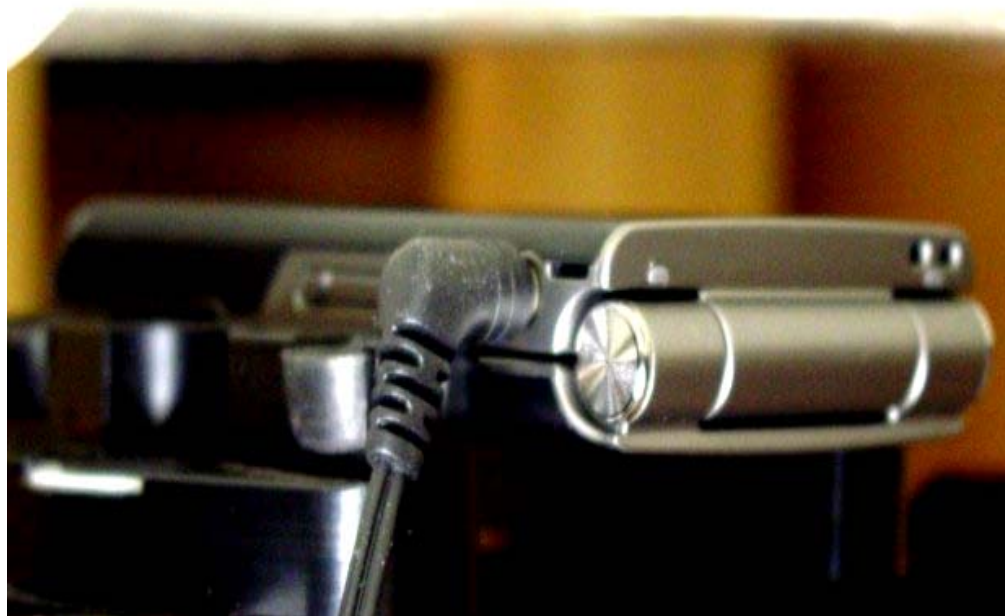
Figure 9E.3 Body SAR Phone setup Flip Closed (15mm Air Separation)