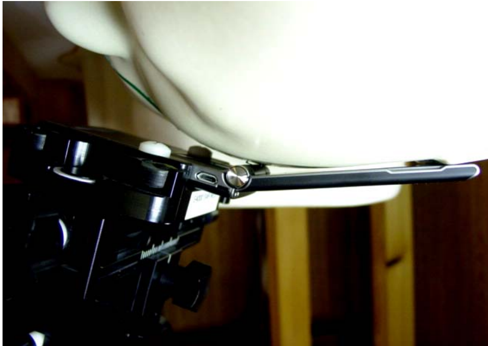
Figure 9E.1 Phone against the head (Left cheek position)