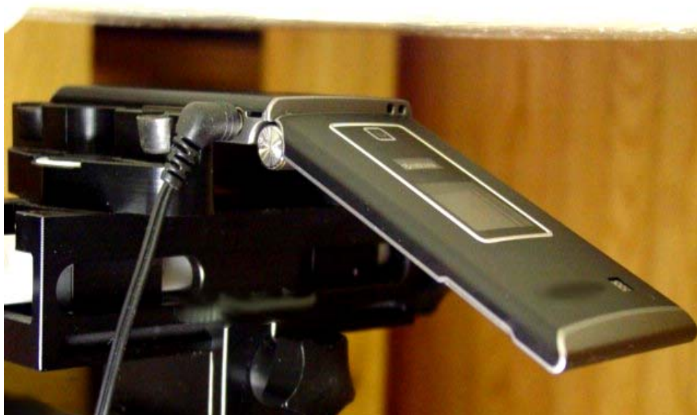
Figure 9E.4 Body SAR Phone setup Flip Opened (15 mm Air Separation)