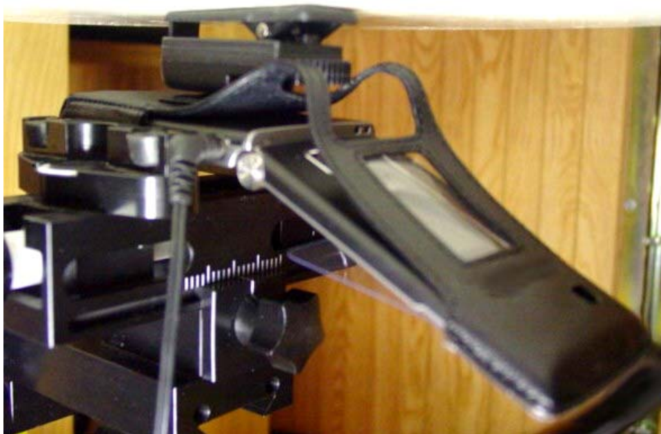
Figure 9E.6 Body SAR Phone setup Flip Open with Leather Case (CV90-P0323-01)