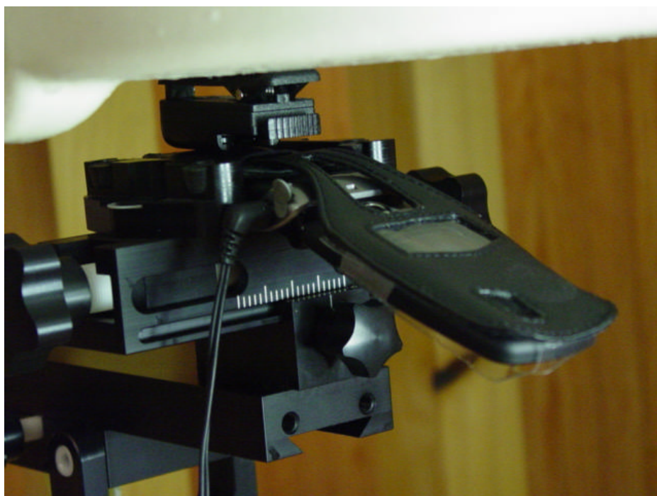
Figure 9E.6 body SAR setup open (with standard case)