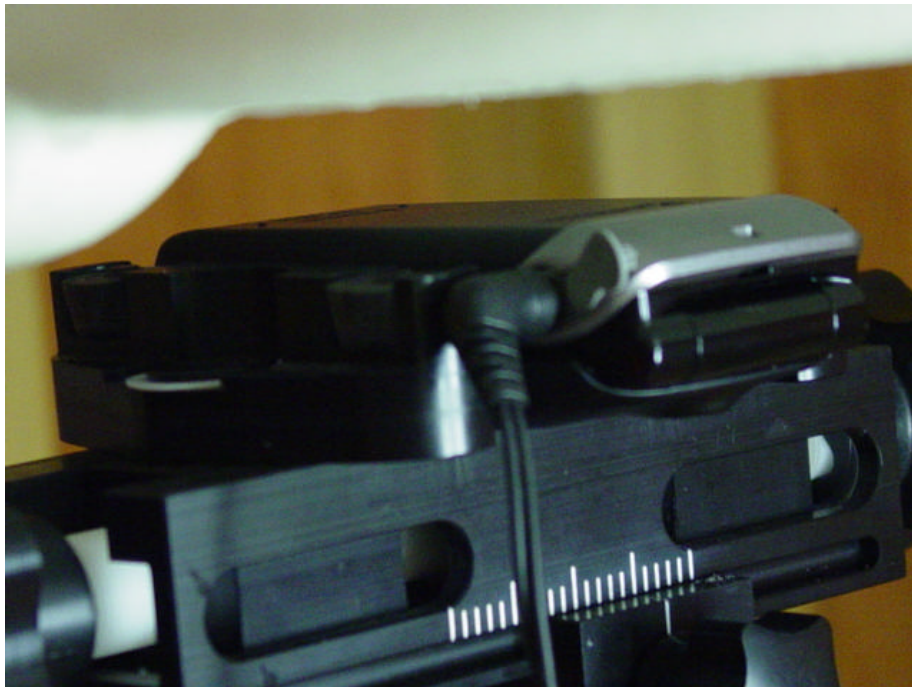
Figure 9E.3 body SAR setup closed (with 15mm air separation)