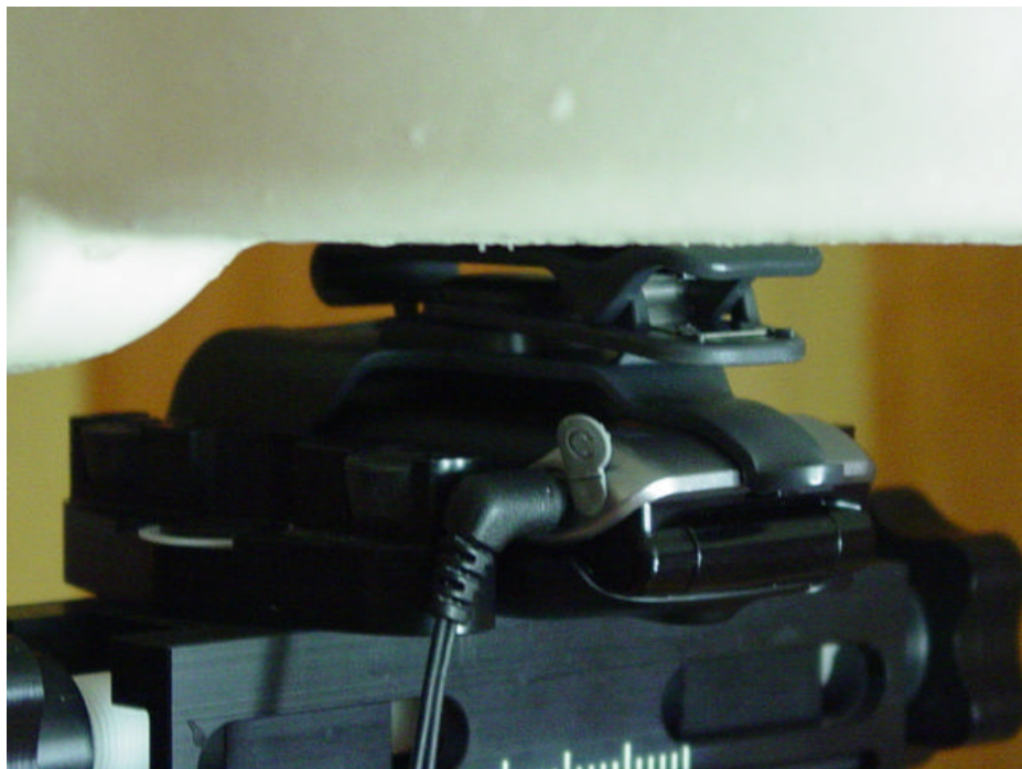
Figure 9E.7 body SAR setup Closed (with Holster)