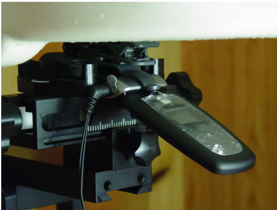
Figure 9E.8 body SAR setup Open (with Holster)