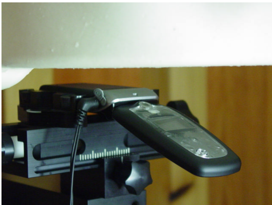
Figure 9E.4 body SAR setup open (with 15mm air separation)