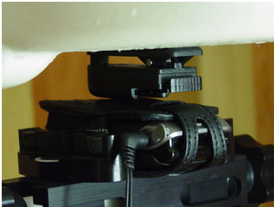
Figure 9E.5 body SAR setup closed (with standard case)