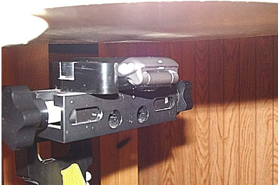
Figure 6. Body SAR setup closed (with 15mm air separation)