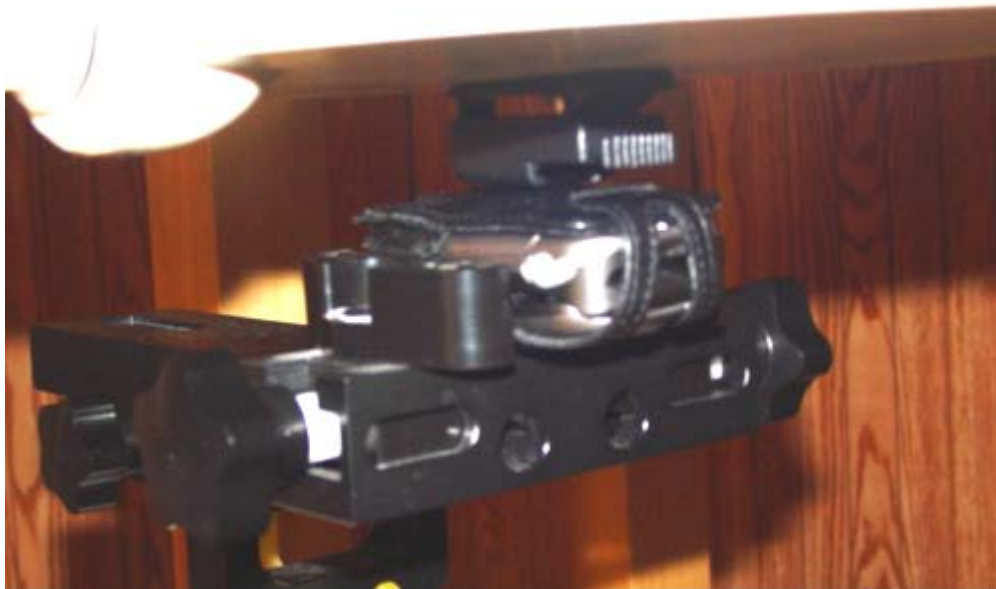
Figure 10. Body SAR setup closed (with premium leather case)