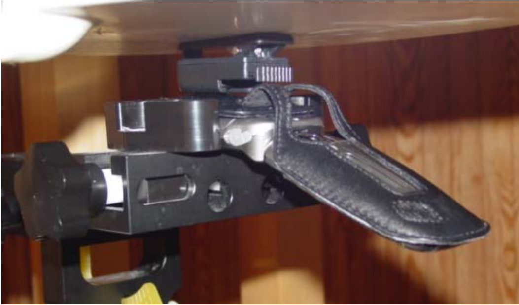
Figure 11. Body SAR setup open (with premium leather case)