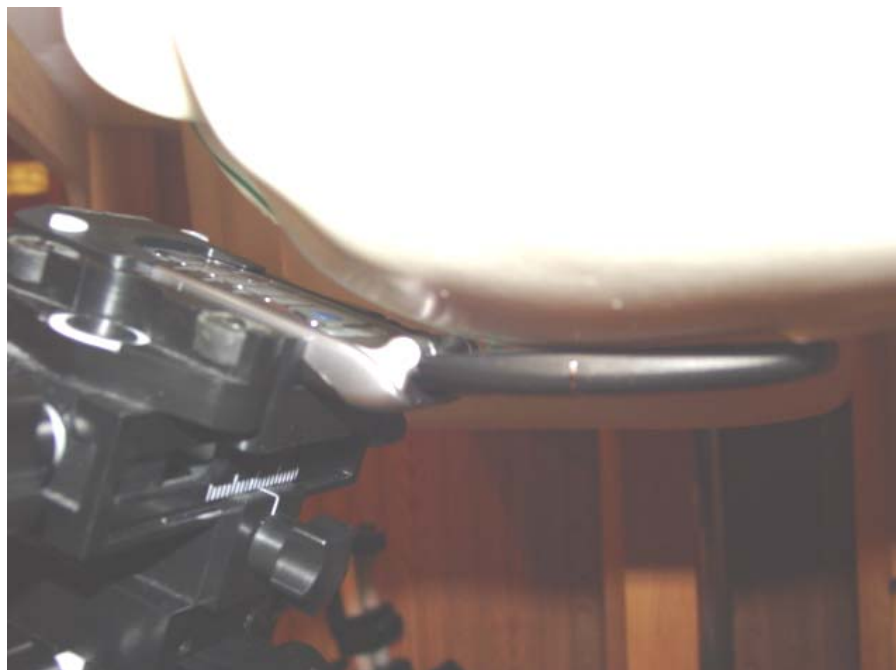
Figure 2. Phone against the head (left cheek position)