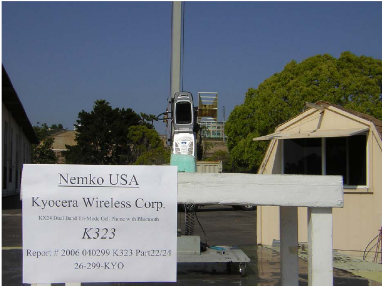
Figure 12. Radiated Emission Test Setup