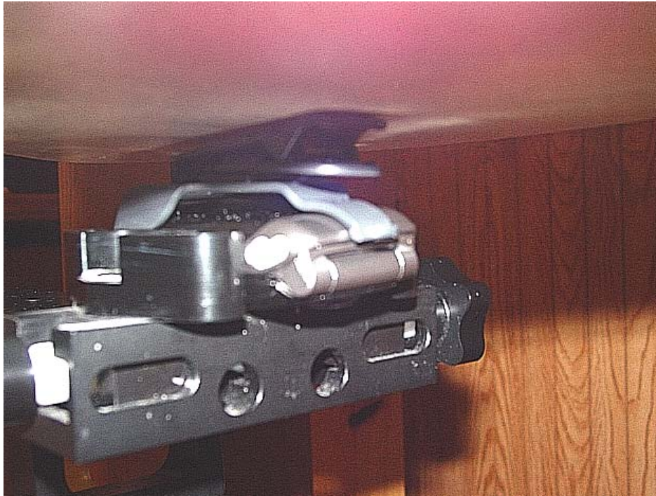
Figure 4. Body SAR setup closed (with holster)