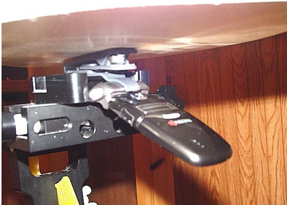
Figure 5. Body SAR setup open (with holster)