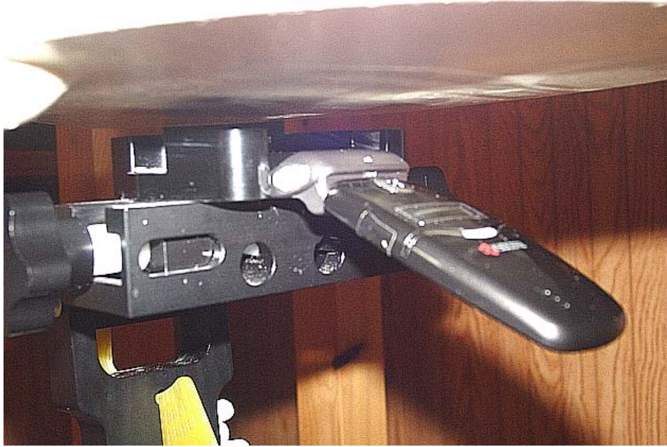
Figure 7. Body SAR setup open (with 15mm air separation)