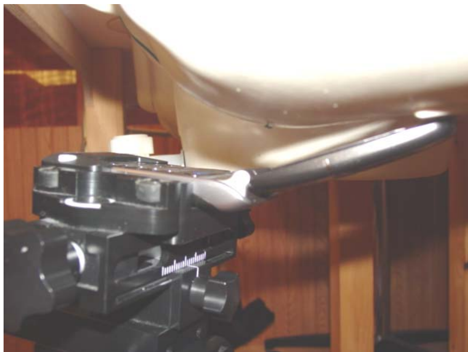
Figure 3. Phone against the head (left tilt position)