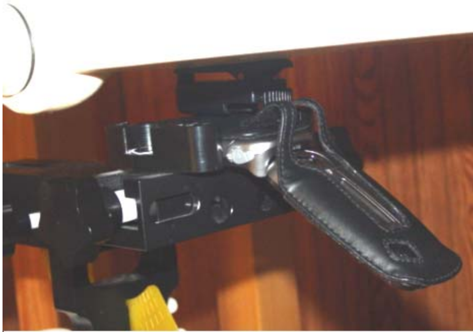
Figure 9. Body SAR setup open (with standard leather case)