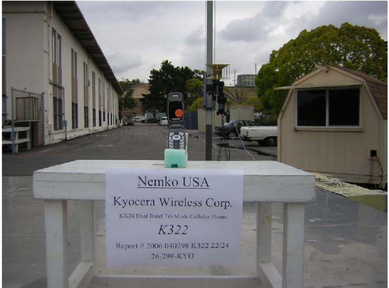
Figure 12. Radiated Emission Test Setup