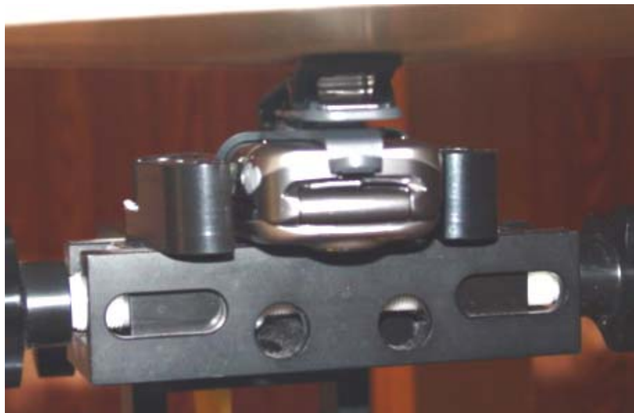
Figure 4. Body SAR setup closed (with holster)