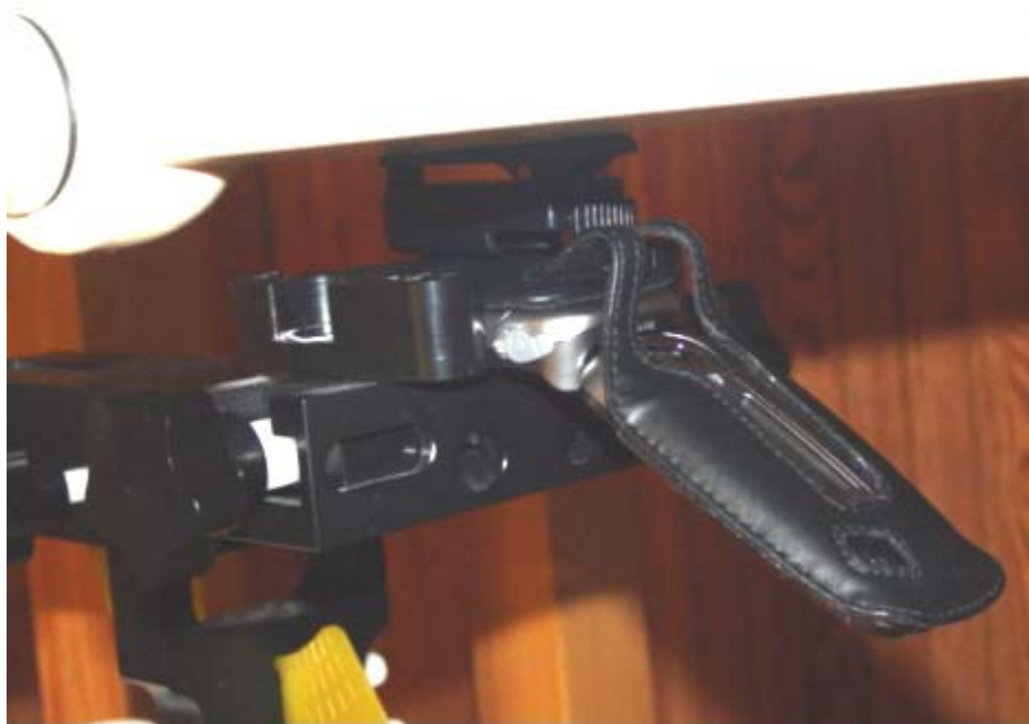
Figure 9. Body SAR setup open (with standard leather case)