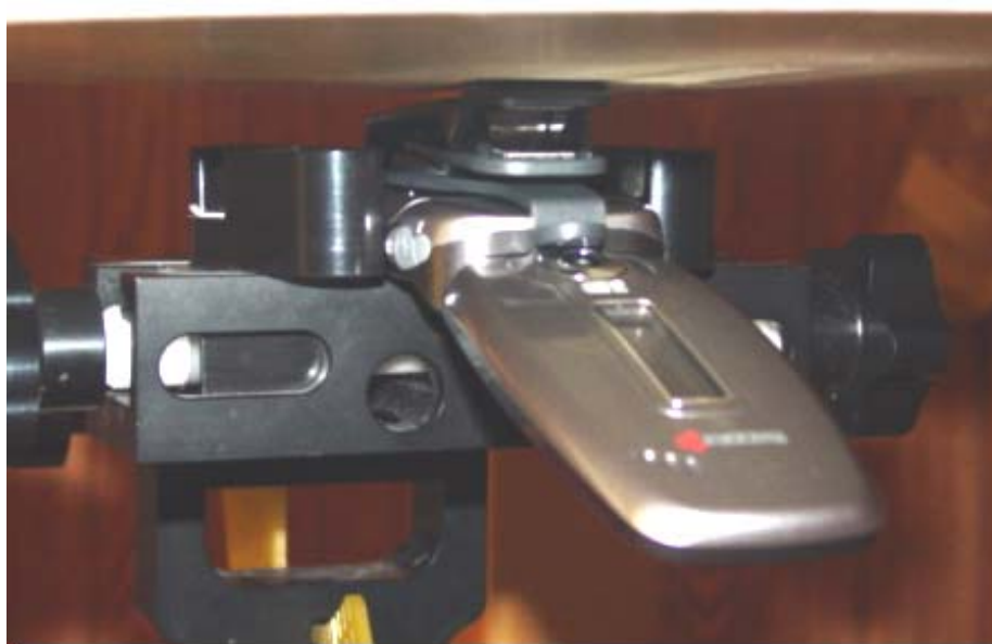
Figure 5. Body SAR setup open (with holster)