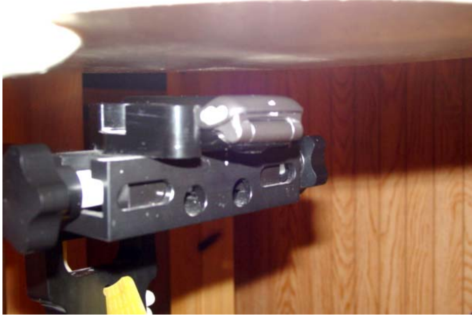
Figure 6. Body SAR setup closed (with 15mm air separation)