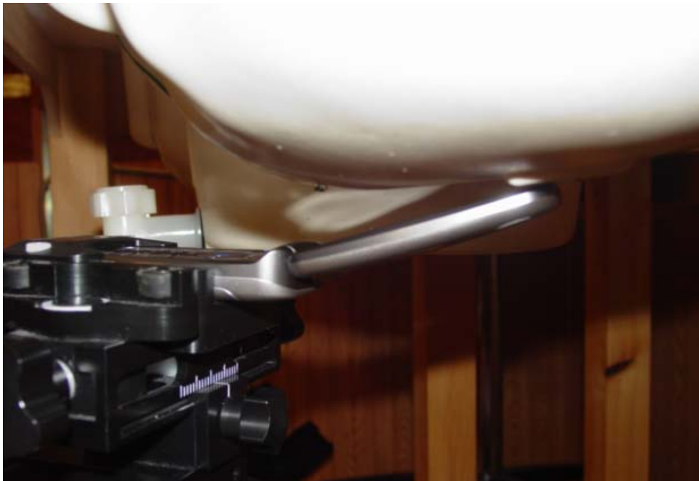
Figure 3. Phone against the head (left tilt position)