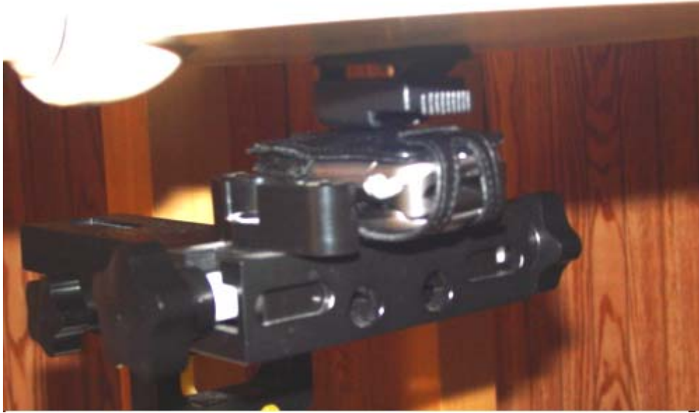
Figure 10. Body SAR setup closed (with premium leather case)