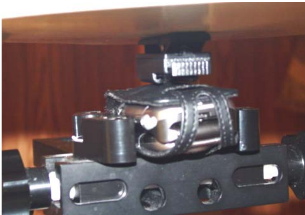
Figure 8. Body SAR setup closed (with standard leather case)