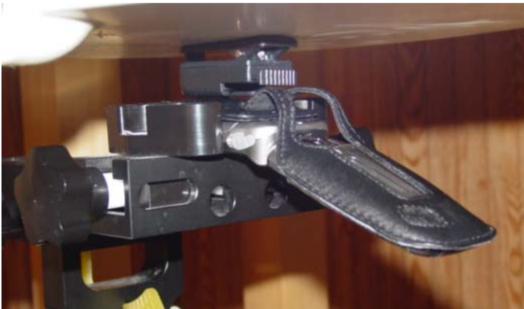
Figure 11. Body SAR setup open (with premium leather case)