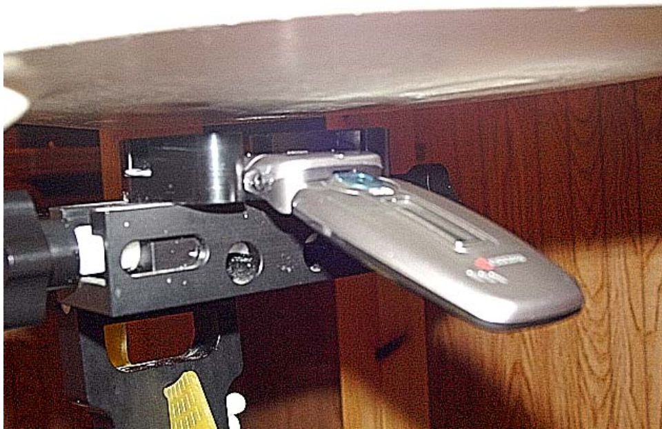
Figure 7. Body SAR setup open (with 15mm air separation)