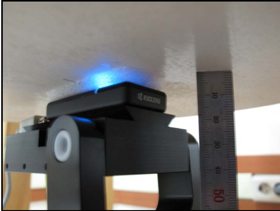
Horizontal Top : The front of EUT face to the Phantom with 5mm separation distance.

The following test configurations have been applied in this report.