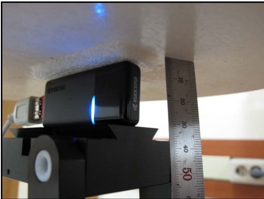
Vertical Left : The right edge of EUT face to the Phantom with 5mm separation distance.