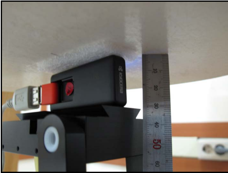
Vertical Right : The right edge of EUT face to the Phantom with 5mm separation distance.