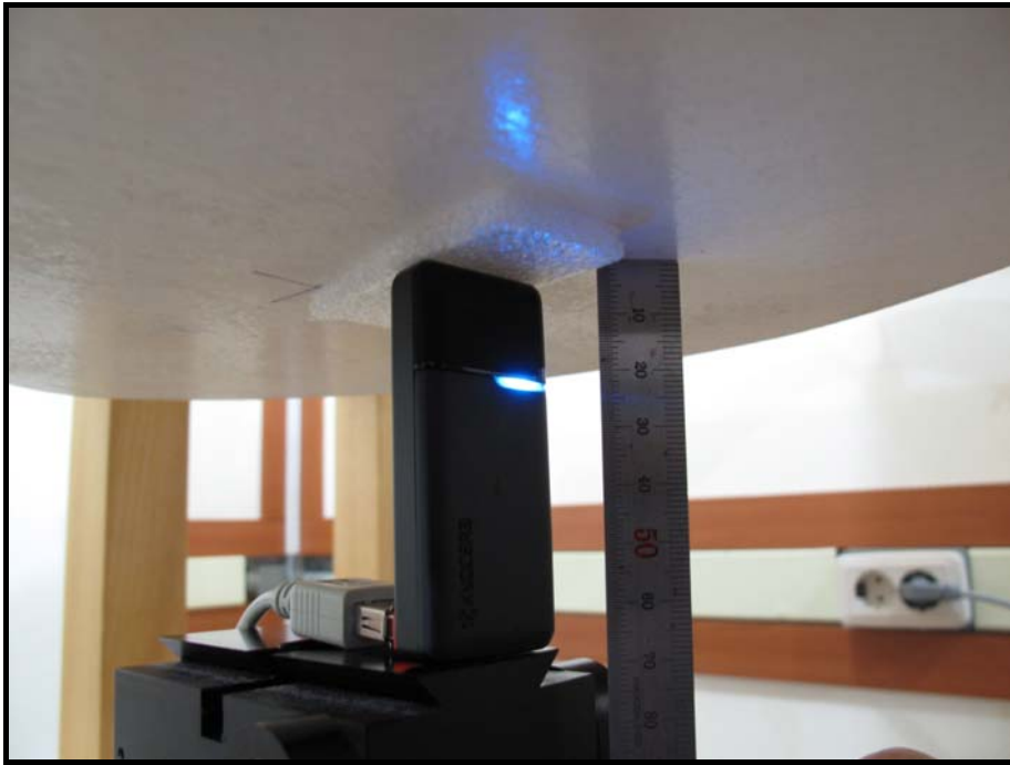
Vertical Top : The front Top side of EUT face to the Phantom with 5mm separation distance.