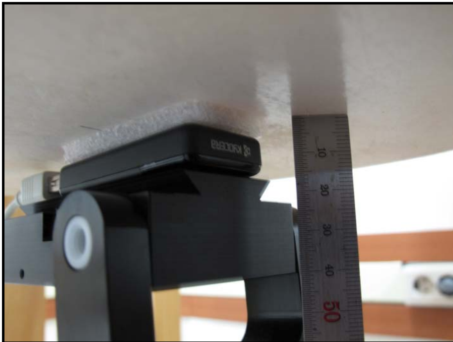
Horizontal Bottom : The bottom of EUT face to the Phantom with 5mm separation distance.