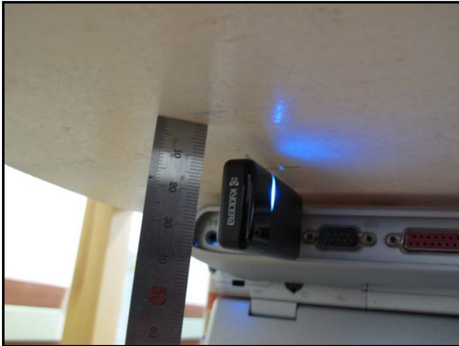
Laptop(Vertical) : The right edge of EUT face to the Phantom with 7mm separation distance.