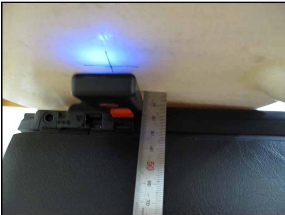
Laptop(Horizontal) : The front of EUT face to the Phantom with 5mm separation distance.