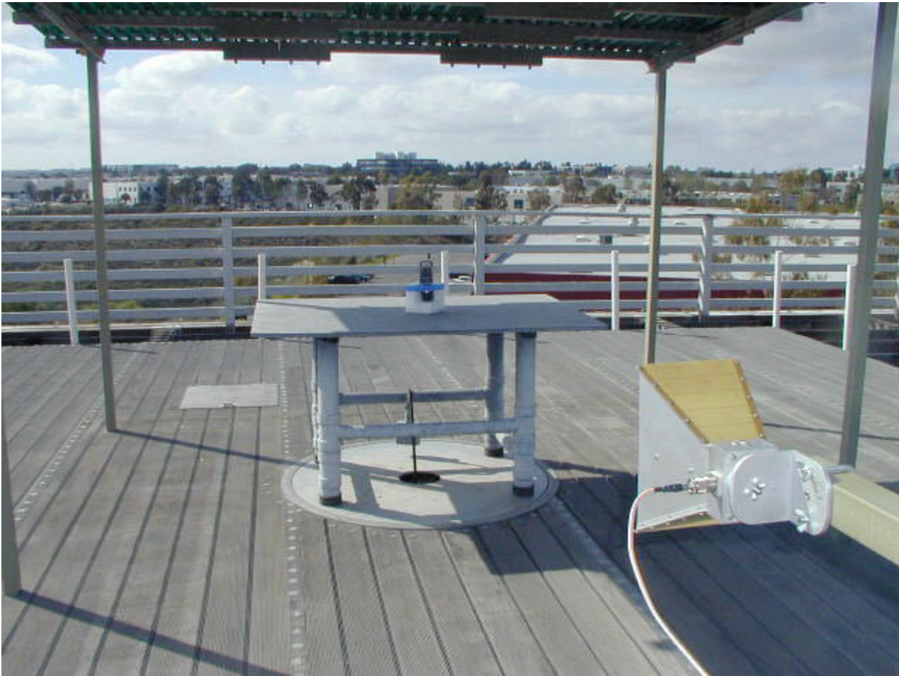
Photograph of Test Setup