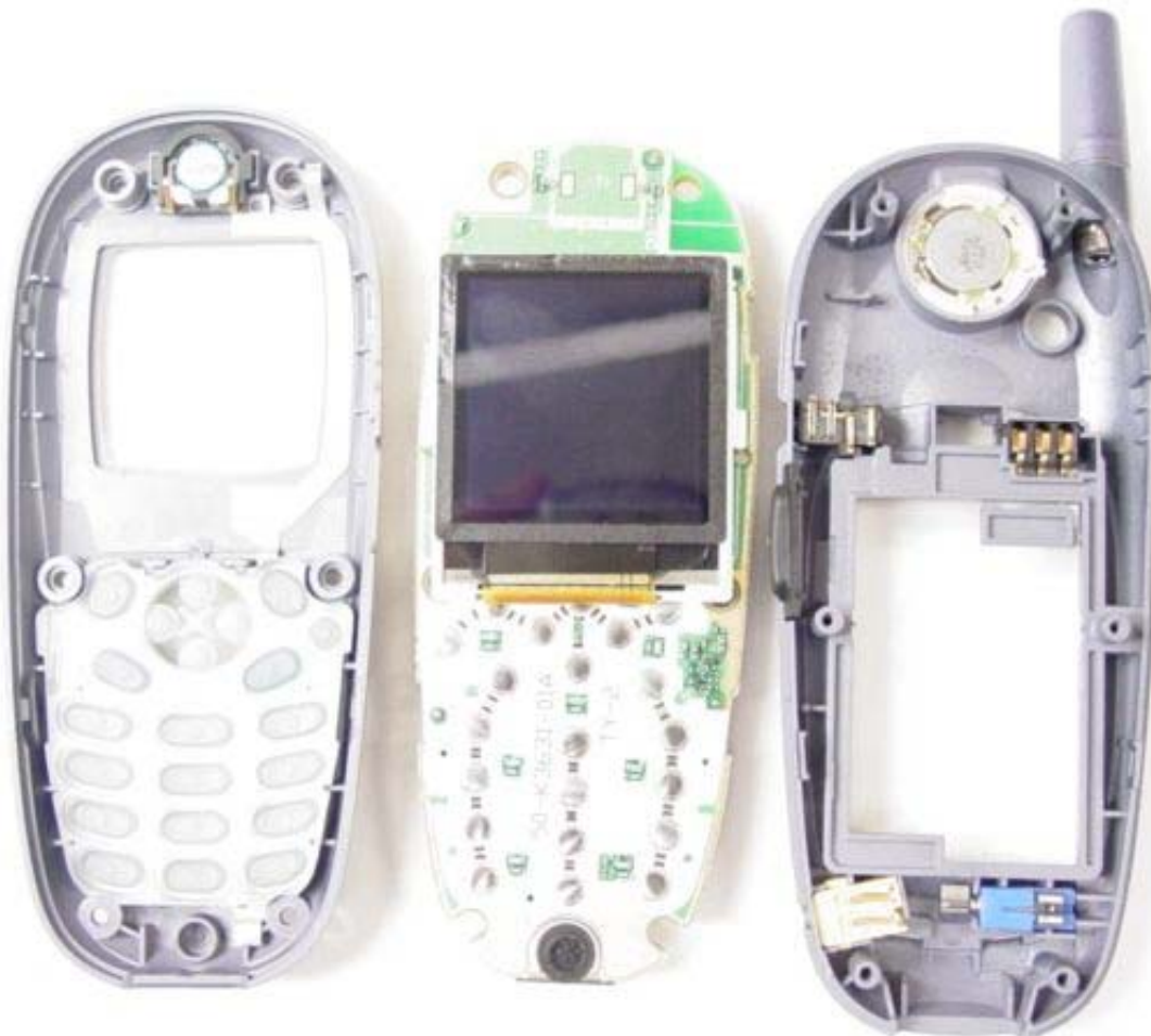
Exhibit 8: Internal Photos