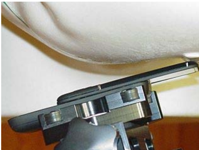
Figure 9E.4 Phone Open against the head (Left Tilt position)