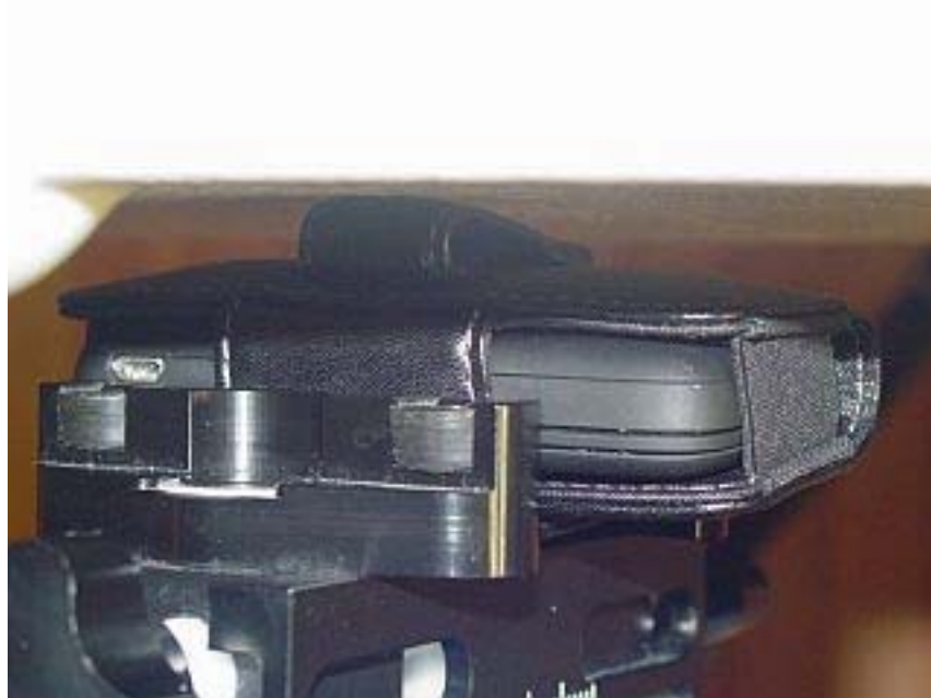
Figure 9E.7 Body SAR setup with Phone Closed (CE90-M288A-01)