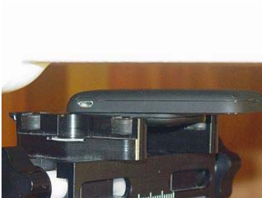
Figure 9E.6 Body SAR setup with Phone Open (15mm Air Separation)