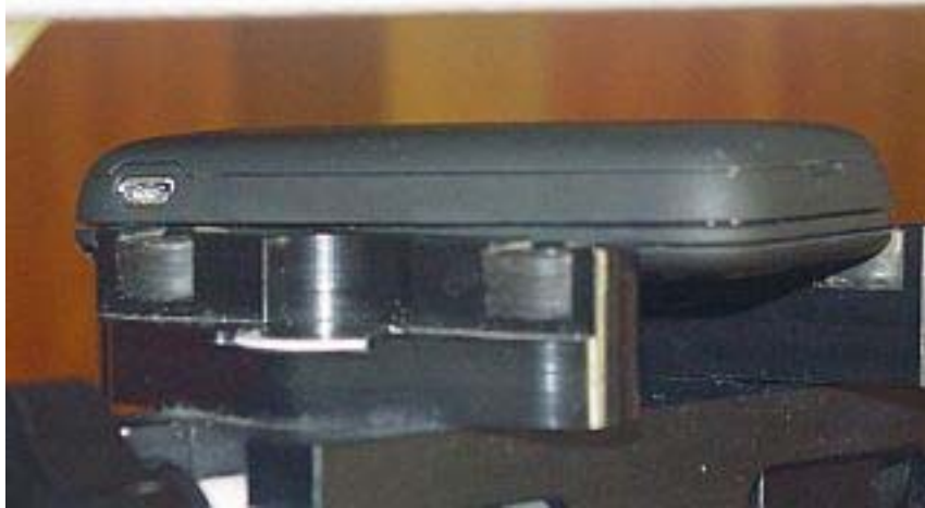
Figure 9E.5 Body SAR setup with Phone Closed(15mm Air Separation)