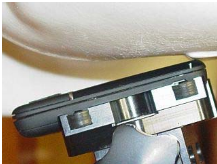
Figure 9E.2 Phone Closed against the head (Left Tilt position)