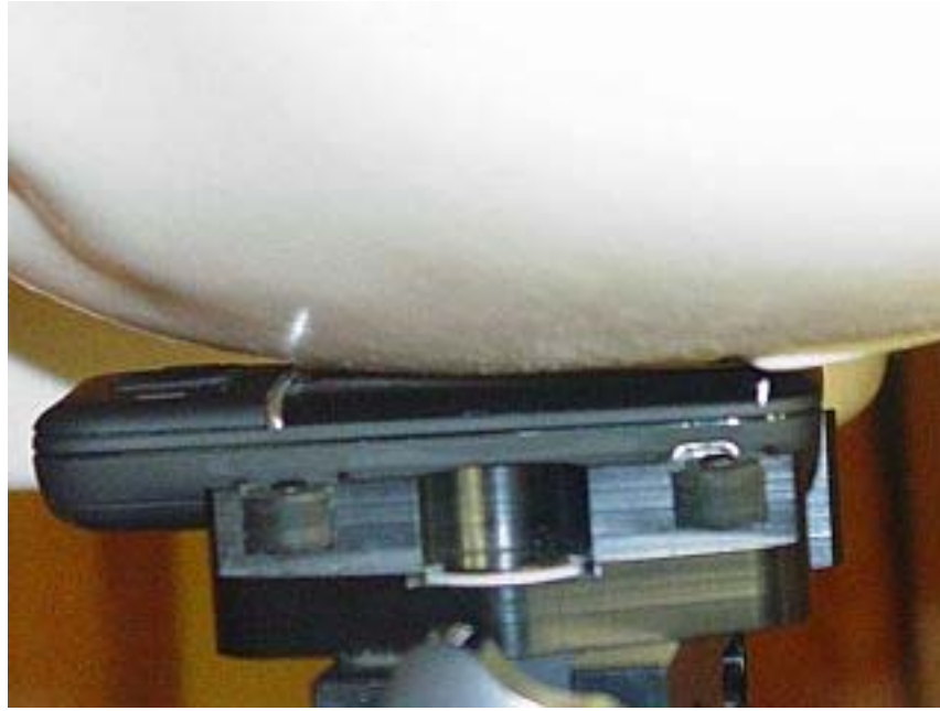
Figure 9E.1 Phone Closed against the head (Left cheek position)