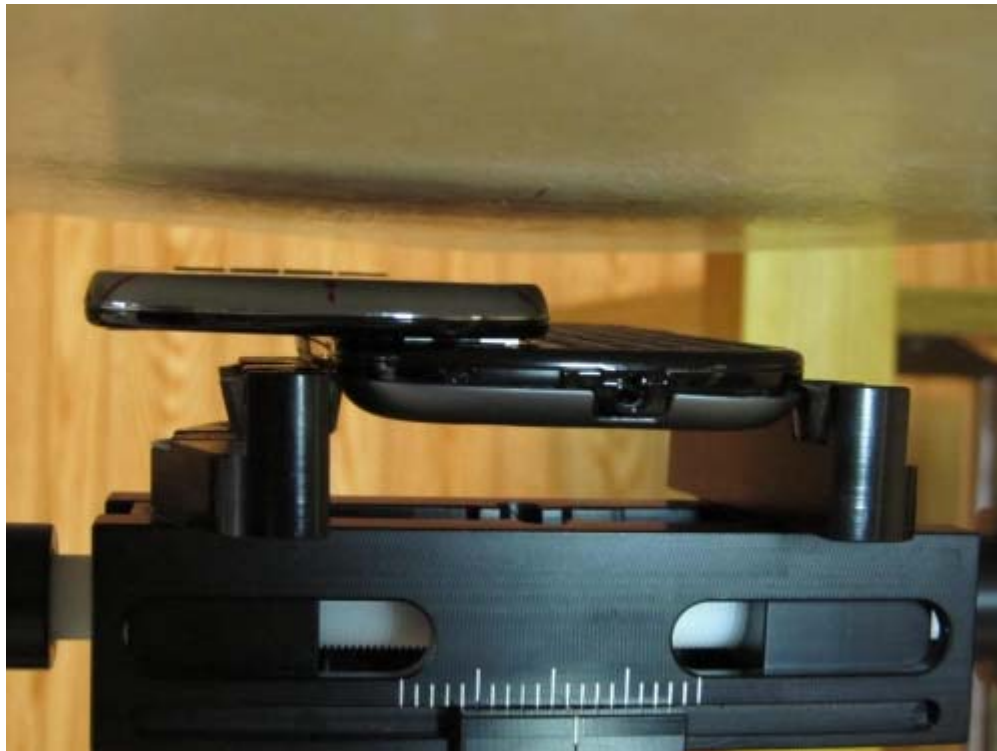
Figure 9E.8 Open FRONT_15 mm