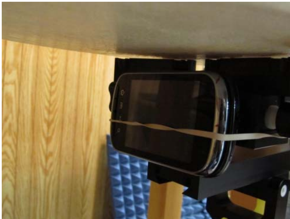
Figure 9E.12 Closed LEFT_10 mm