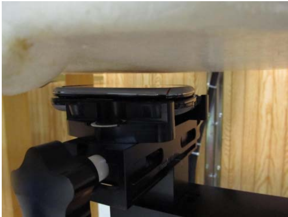
Figure 9E.9 Closed FRONT_10 mm