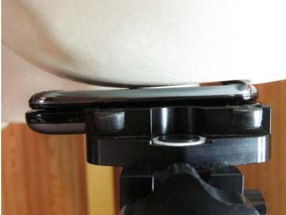
Figure 9E.1 Phone Closed against the head (Left cheek position)