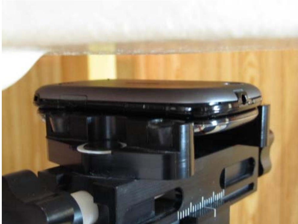
Figure 9E.5 Closed BACK_15 mm