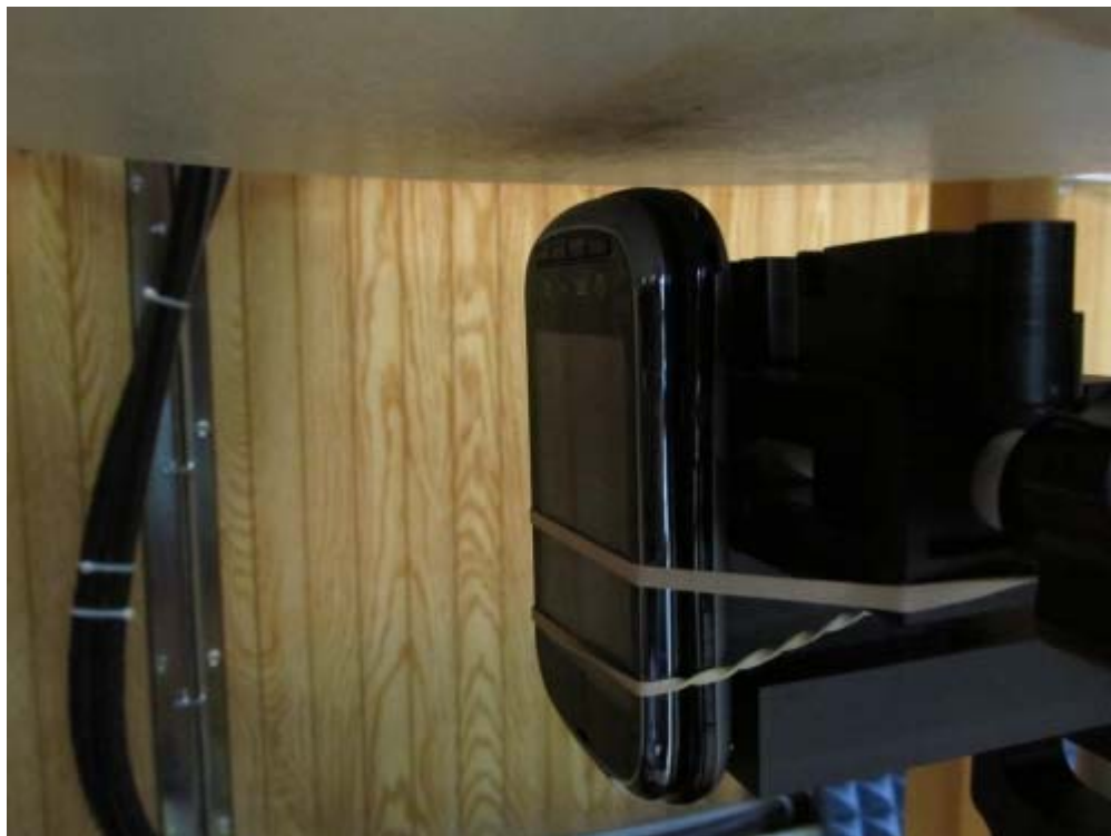
Figure 9E.14 Closed BOTTOM_10 mm