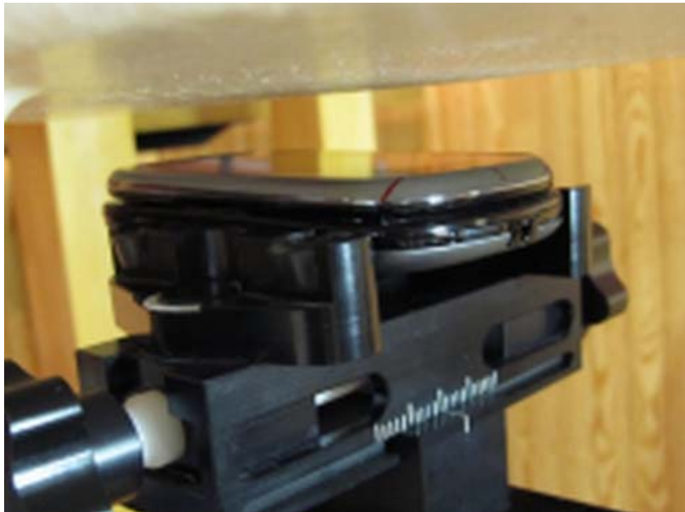
Figure 9E.6 Closed FRONT_15 mm