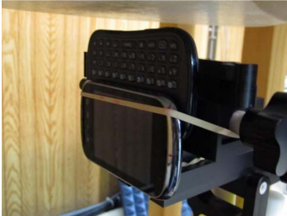
Figure 9E.17 Open LEFT_10 mm