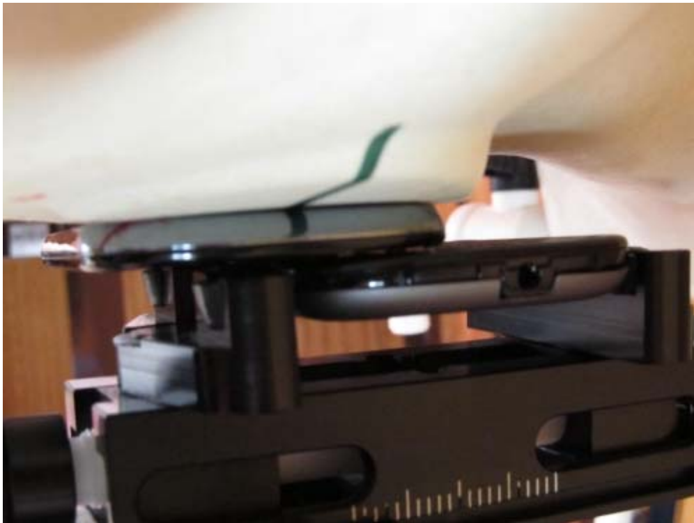
Figure 9E.3b Phone Open against the head (Left cheek position)_Top View