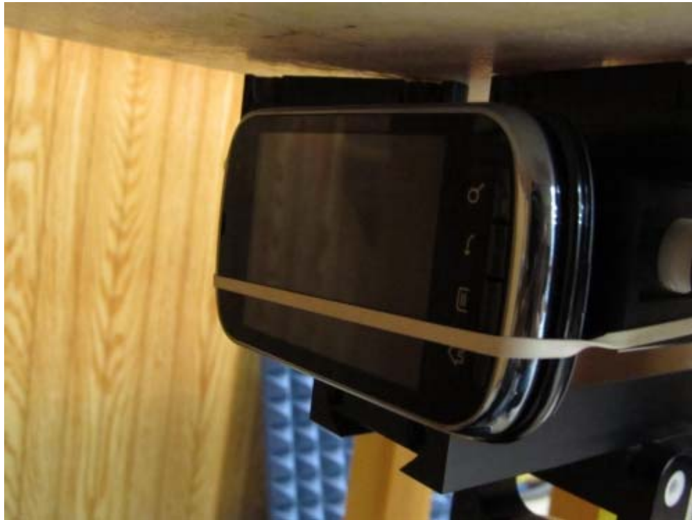
Figure 9E.13 Closed RIGHT_10 mm