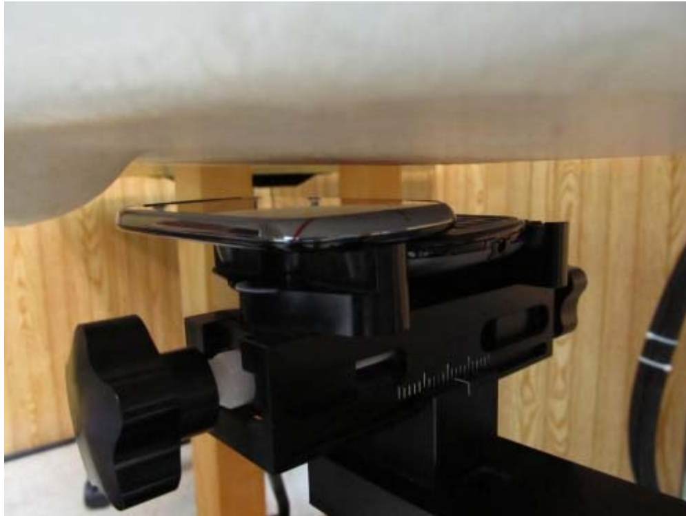
Figure 9E.15 Open FRONT_10 mm