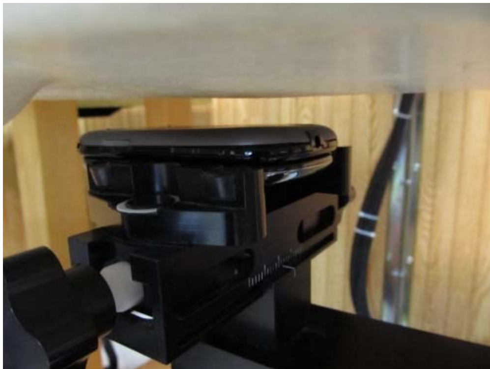
Figure 9E.10 Closed BACK_10 mm