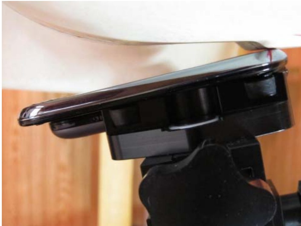
Figure 9E.4a Phone Open against the head (Left Tilt position)_Side View