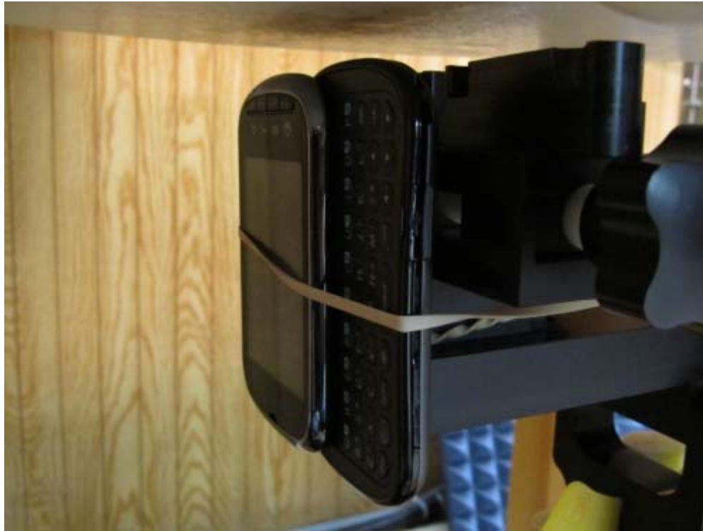
Figure 9E.20 Open BOTTOM_10 mm