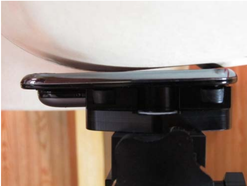
Figure 9E.3a Phone Open against the head (Left cheek position)_Side View