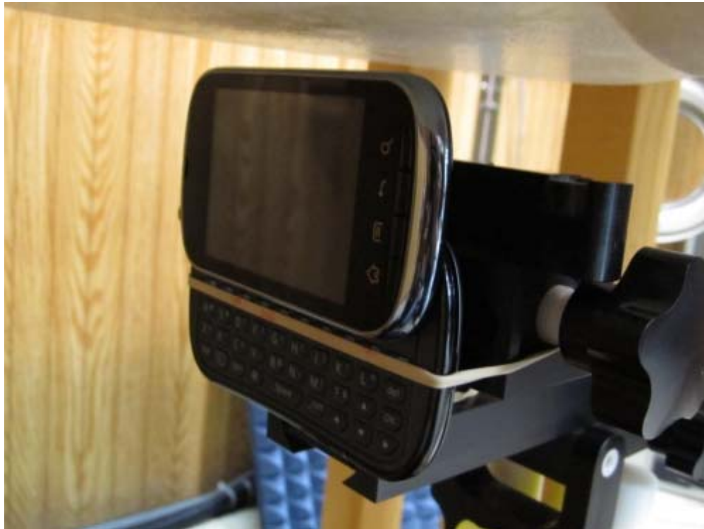
Figure 9E.18 Open RIGHT_10 mm