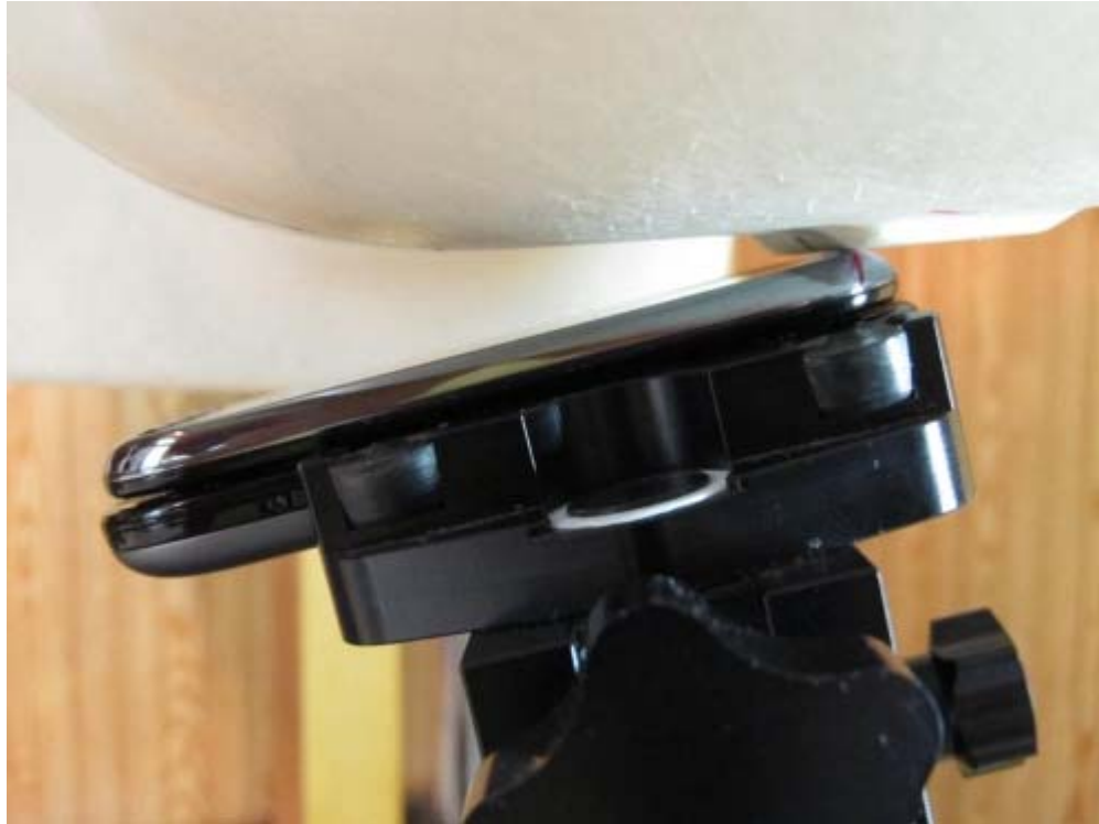
Figure 9E.2 Phone Closed against the head (Left Tilt position)