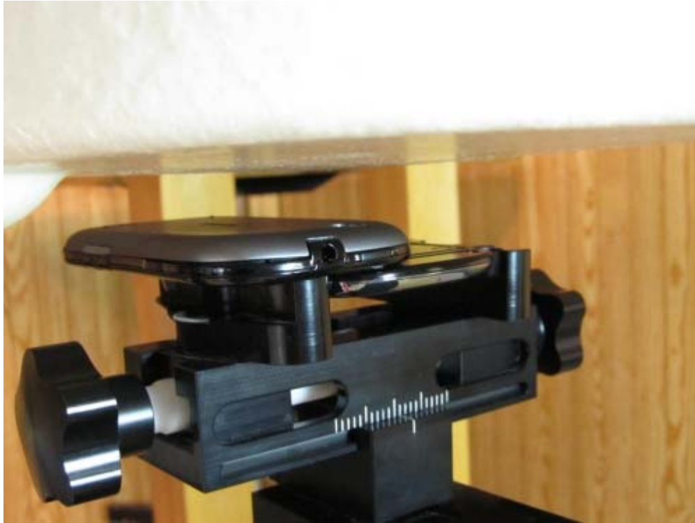
Figure 9E.7 Open BACK_15 mm