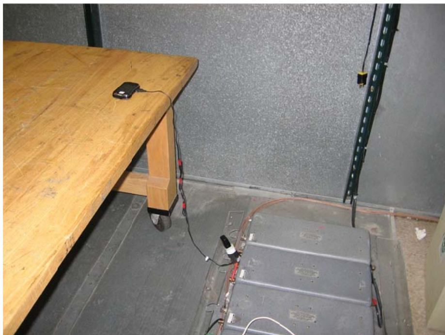
Test Setup Example Shown