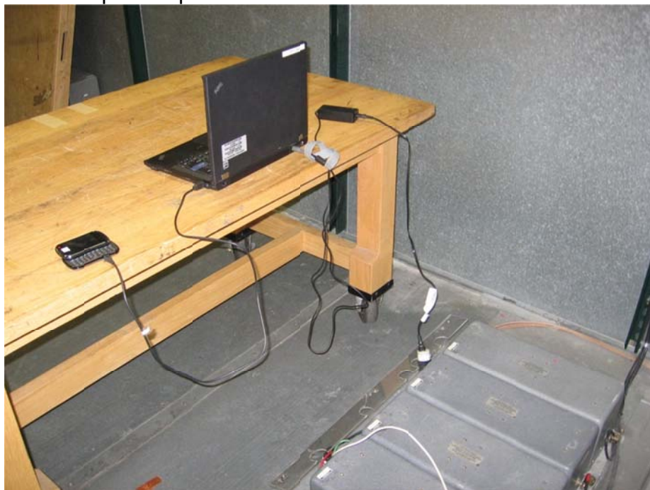
Test Setup Example Shown