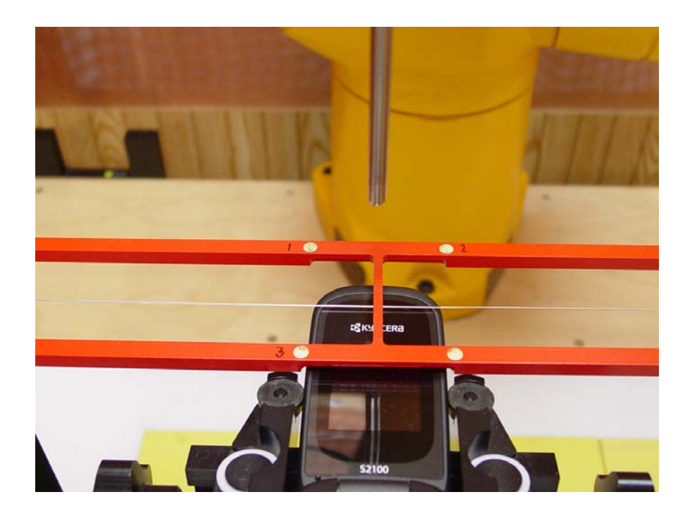
Figure 1b - HAC T-Coil Test Setup