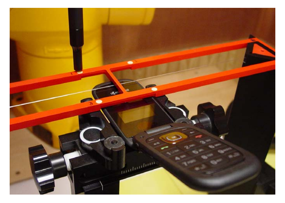
Figure 1a - HAC RF Emission Test Setup