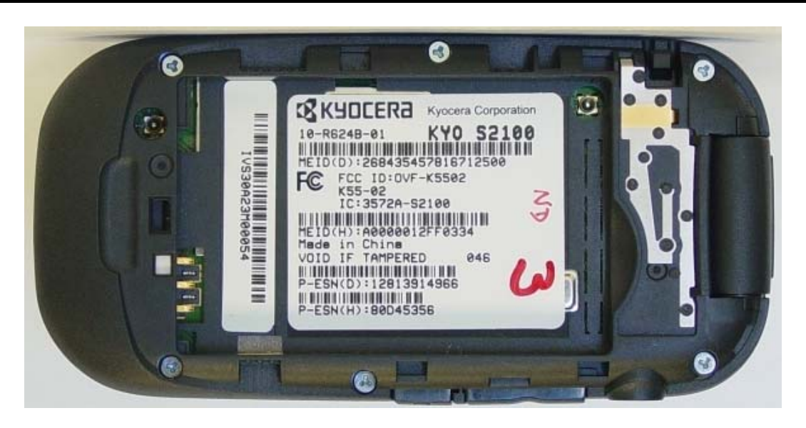
EXHIBIT 8: INTERNAL PHOTOS