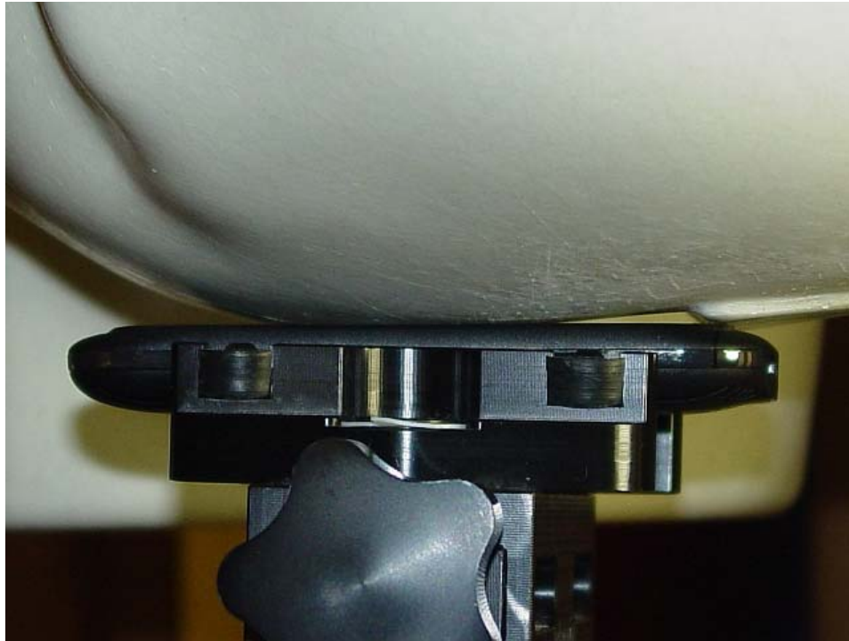
Figure 9E.1 Phone against the head (Left cheek position)