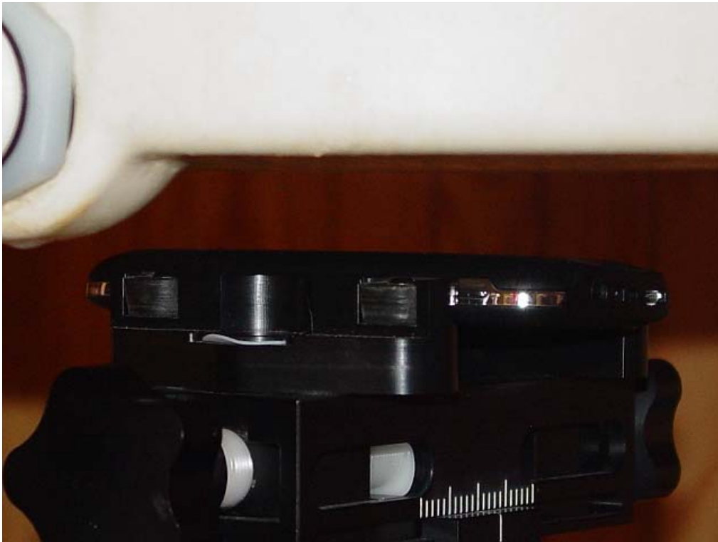
Figure 9E.3 Body SAR setup (15mm Air Separation - Back)