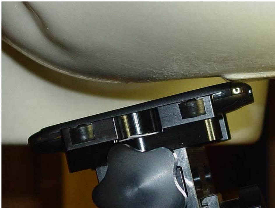
Figure 9E.2 Phone against the head (Left Tilt position)