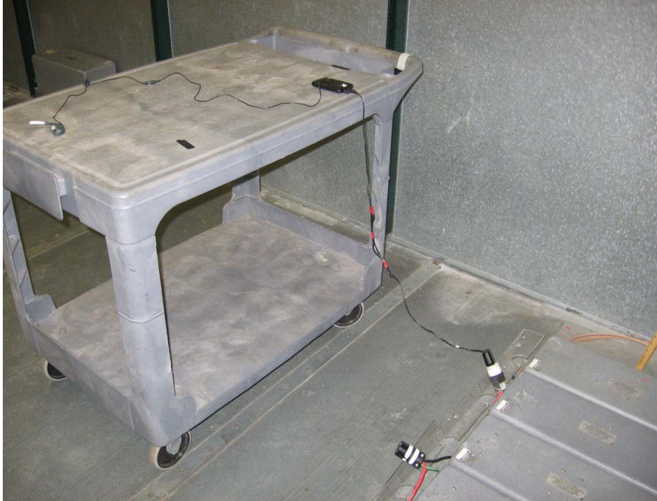
Test Setup Example Shown