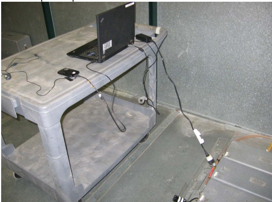
Test Setup Example Shown