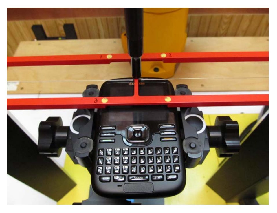
Figure 1b – HAC RF Emission Test Setup

© 2011 Comptest Services LLC Page 1 of 1 HAC RF Setup Photos This report shall not be reproduced except in full, without the written consent of CompTest Services LLC.