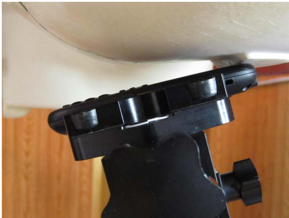
Figure 9E.2 Phone against the head (Left Tilt position)