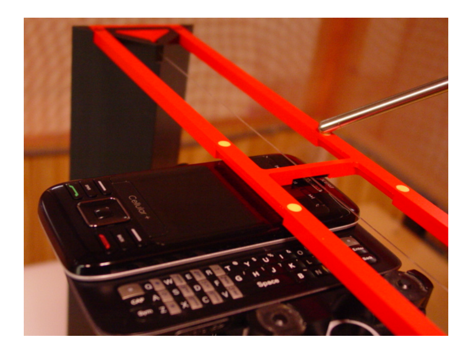
Figure 2b - HAC T-Coil Test Setup for Opened Configuration