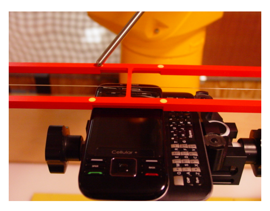
Figure 2a - HAC T-Coil Test Setup for Opened Configuration