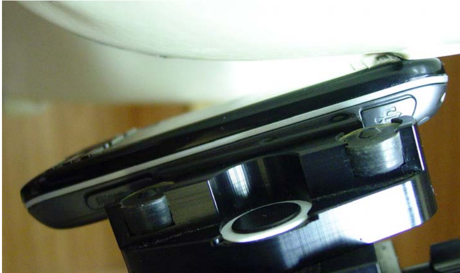
Figure 9E.4 Phone Closed against the head (Left Tilt position)