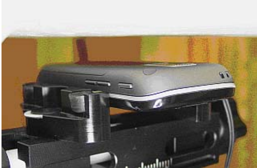
Figure 9E.6 Body SAR setup with Phone Closed (15mm Air Separation)