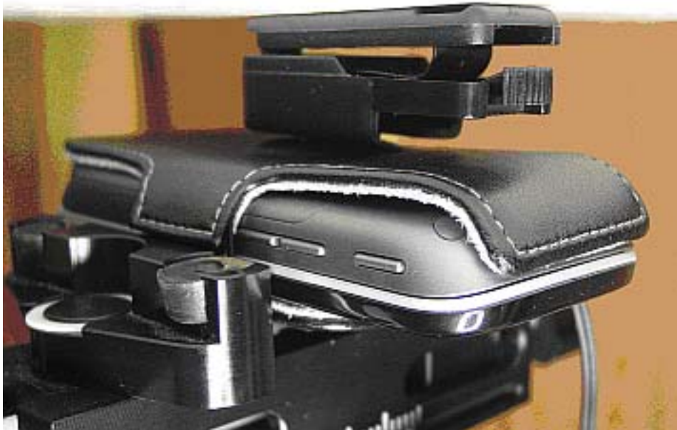
Figure 9E.7 Body SAR setup with Phone Closed (CE90-R2743-01)