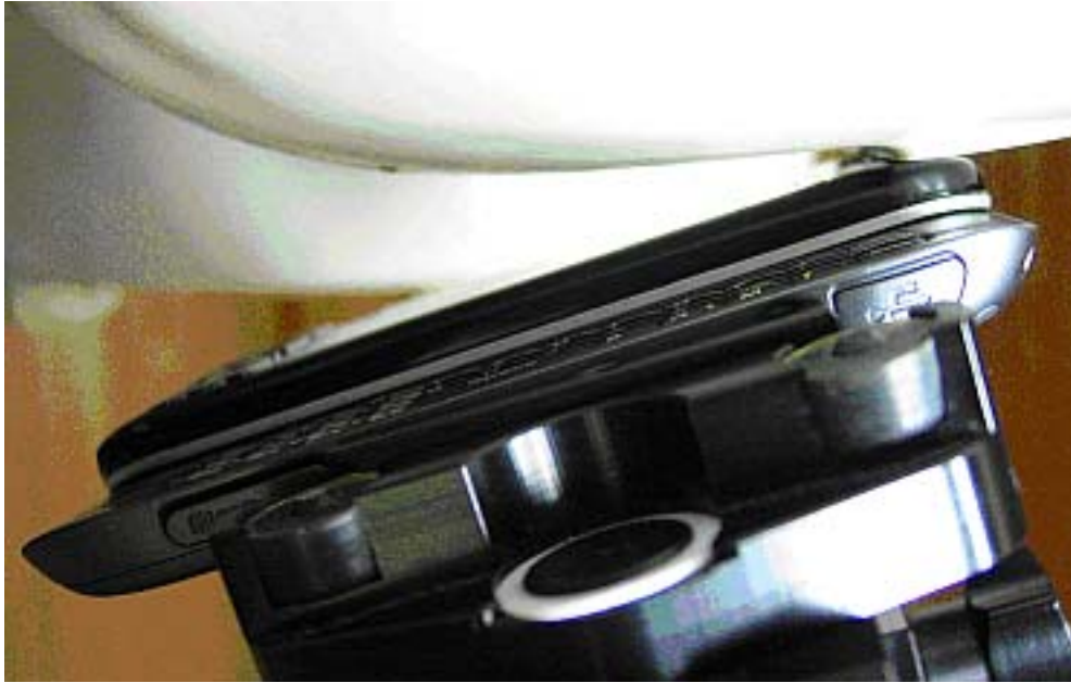
Figure 9E.3 Phone Open against the head (Left Tilt position)