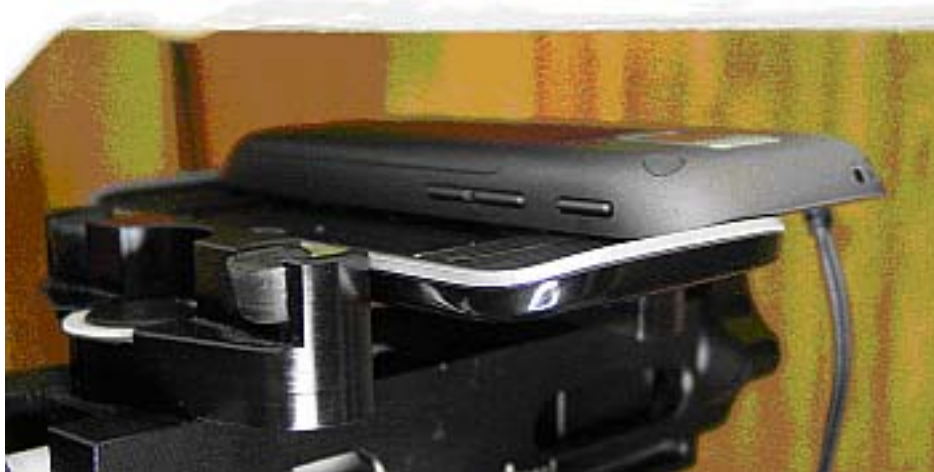
Figure 9E.5 Body SAR setup with Phone Open (15mm Air Separation)