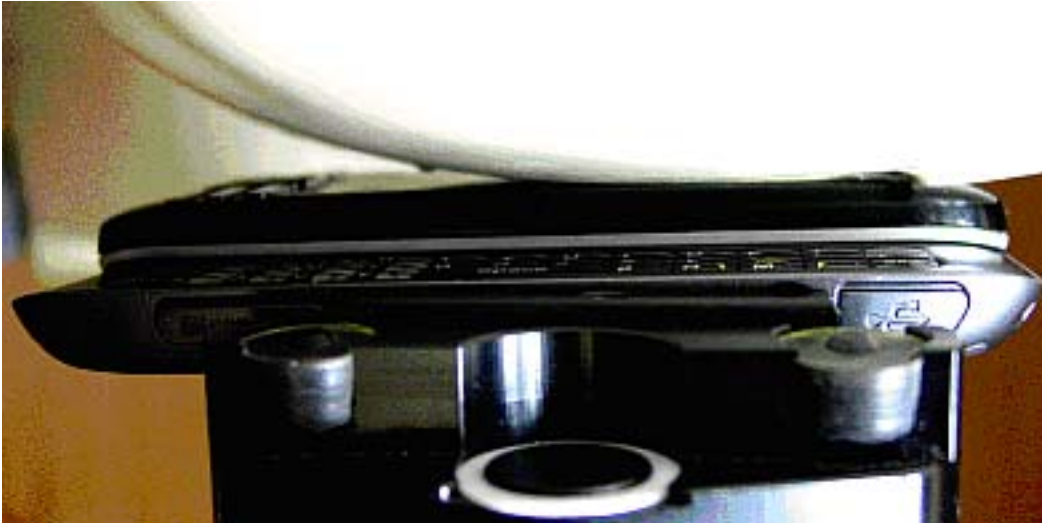
Figure 9E.1 Phone Open against the head (Left cheek position)