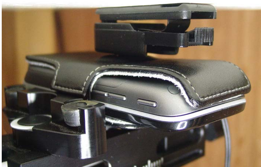
Figure 9E.7 Body SAR setup with Phone Closed (CE90-R2743-01)