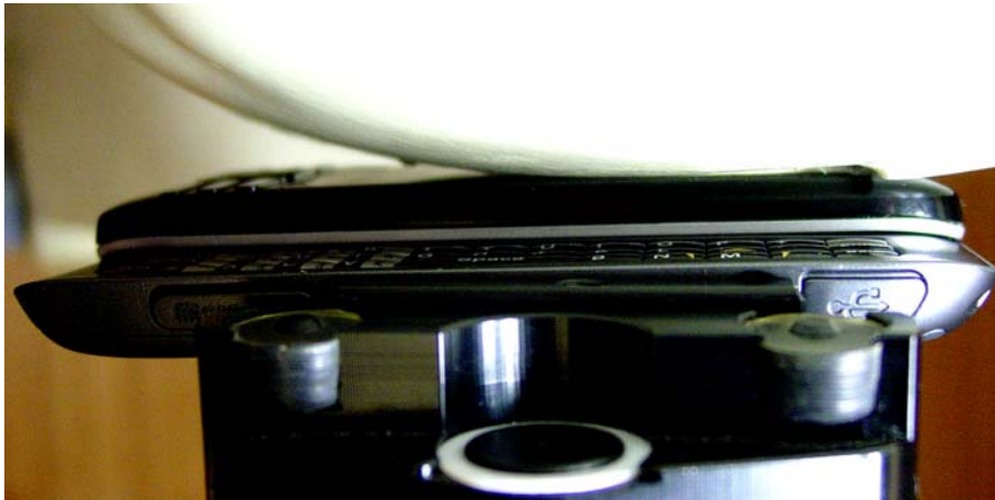
Figure 9E.1 Phone Open against the head (Left cheek position)