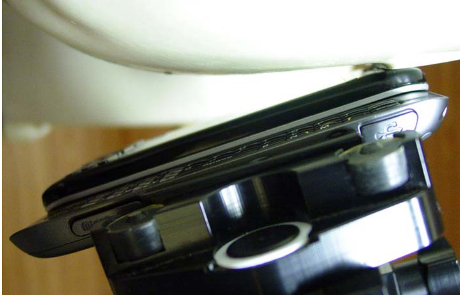
Figure 9E.3 Phone Open against the head (Left Tilt position)