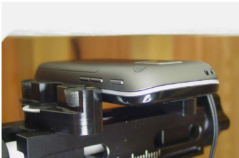
Figure 9E.6 Body SAR setup with Phone Closed (15mm Air Separation)