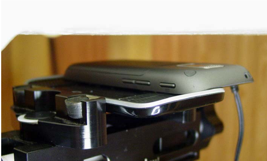
Figure 9E.5 Body SAR setup with Phone Open (15mm Air Separation)