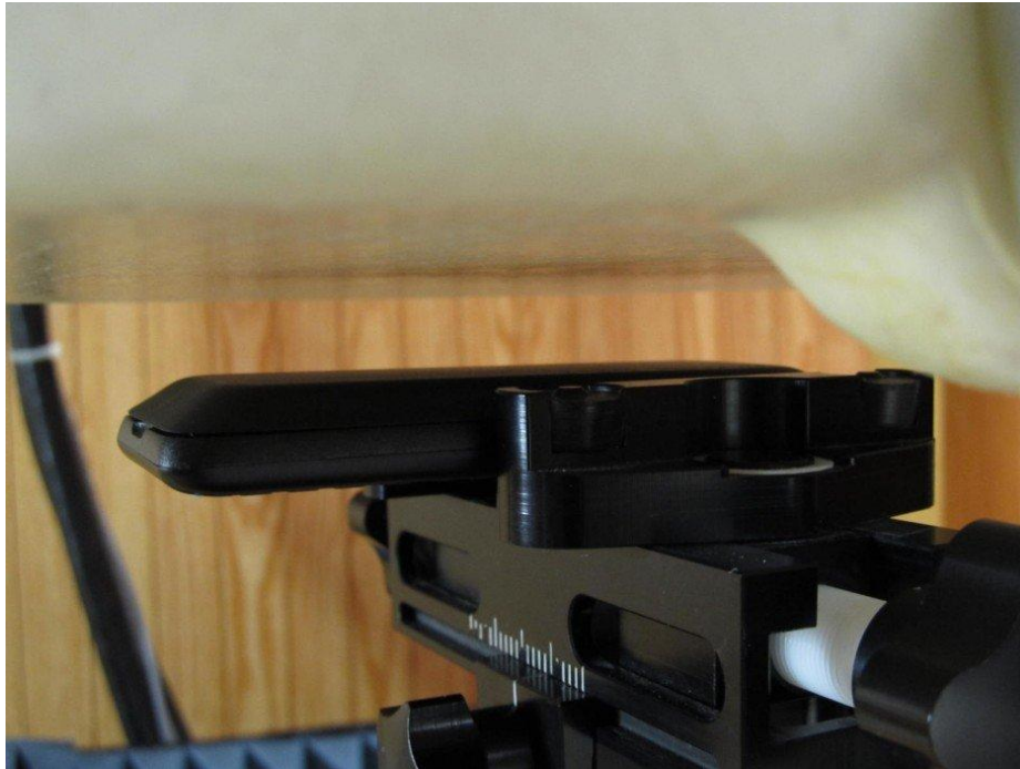
Figure 9E.3 BACK_15 mm