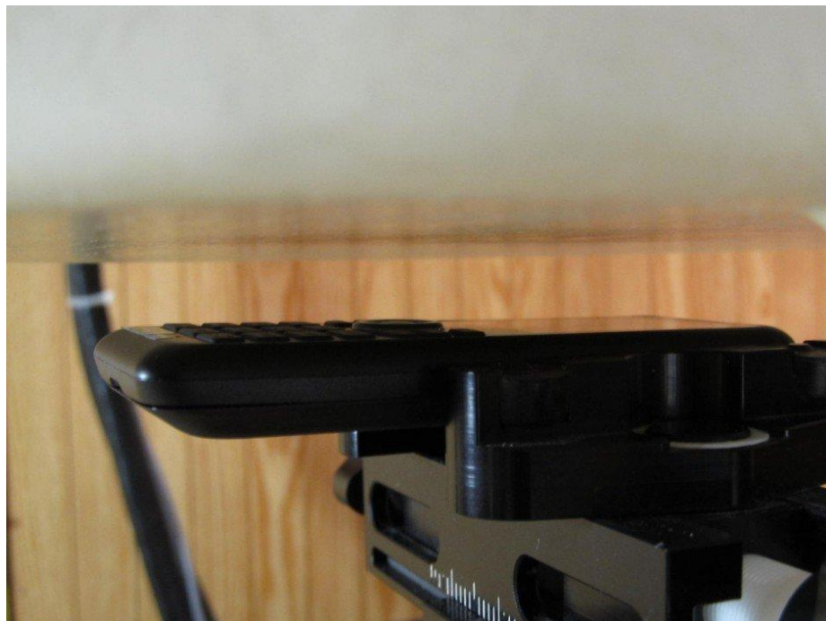
Figure 9E.4 FRONT_15 mm